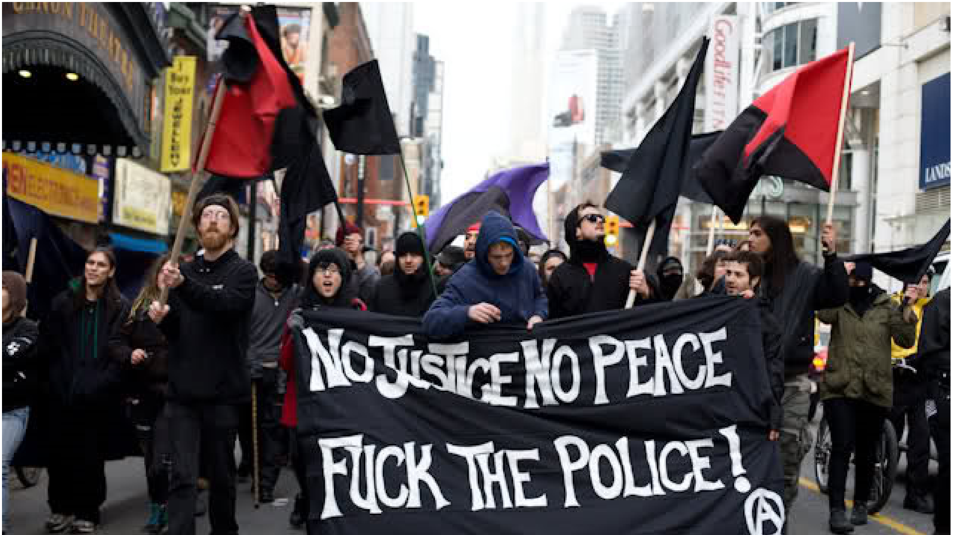
MARCH 15 2011 - TAKING THE STREETS IN TORONTO