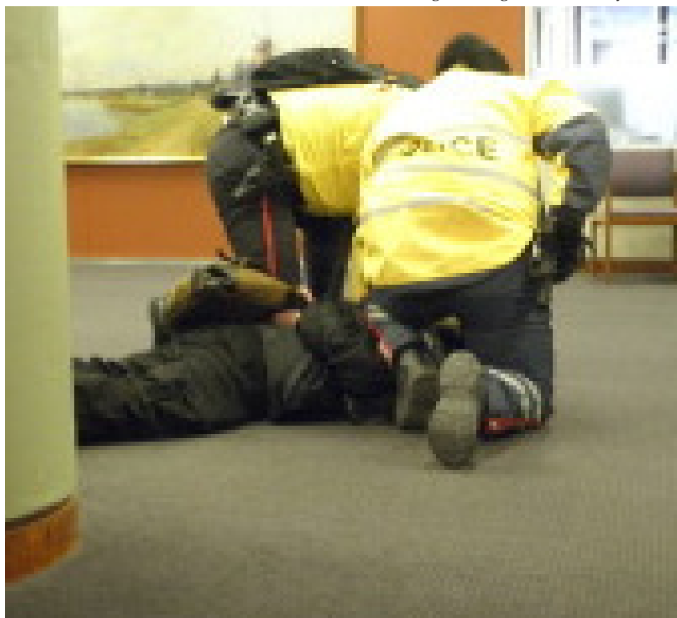
TORONTO COPS SERVING AND PROTECTING THE RICH

Those of us who are forced to sell hours of our lives to our bosses should not only acknowledge the audacious irony and hypocrisy of the Ford brother’s obsession with demanding everyone but themselves ‘get a job’, but must also defend the dignity of those who are unable to sell themselves for a wage due to serious health issues. The hired guns that beat the homeless, shoot down our racialized youth, and rape women and trans people living on the margins are the same government bullies that have historically turned their batons on striking workers. We have the same interests and the same greedy enemies. We must make a common global front that fights for our collective dignity while maintaining our own unique voices. We must strike together while thinking for ourselves; our lands and minds are rich and fertile enough to abolish this miserable existence as beggars and wage-slaves—and we will have our goddamned dignity one way or the other.