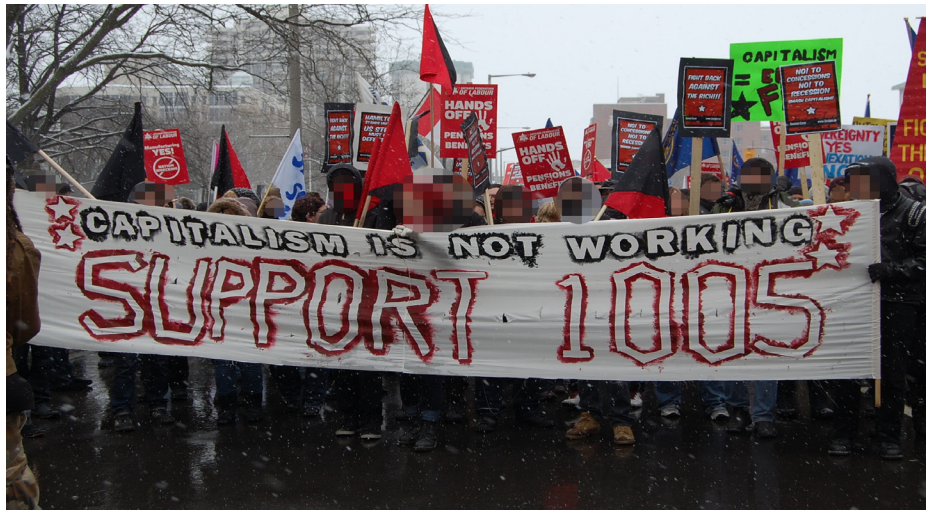
ANTI-CAPITALIST BLOC IN HAMILTON

On Saturday January 29th several thousand people took to the streets of Hamilton in support of United Steelworkers 1005 locked out of US Steel Hamilton and against Stephen Harper attacks on working people across the country. Dubbed “The People VS US Steel” the demonstration organized by the Ontario Federation of Labour (OFL) was the largest in Hamilton in a decade and promised to be “the Largest Anti-Harper Protest Ever.”