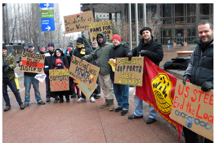
PITTSBURGH ANARCHISTS SUPPORT USW 1005

Local 1005: Pittsburgh stands behind you! In the struggle for better lives for workers and their families, in Hamilton, in Pittsburgh, and everywhere else. In the struggle to build an international workers movement capable of making the rich pay for their own recession!