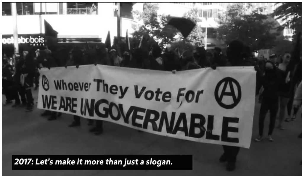
2017: Let's make it more than just a slogan.

According to the New York Times, “A small, hard core of the country’s disaffected youth hurled sticks, stones, bottles, cans, obscenities, and a ball of tin foil at President Nixon” and his entourage during the inaugural parade. As