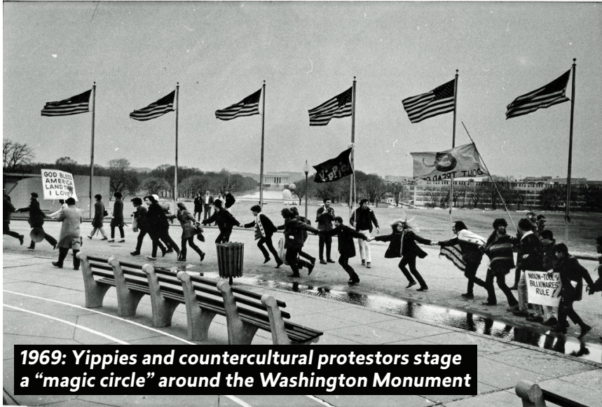
1969: Yippies and countercultural protestors stage a "magic circle" around the Washington Monument

Nixon's motorcade approached, the protestors threw firecrackers and smoke and paint bombs, forcing the President's car to speed away. After police drove them back from the parade route, the 300-400 "ultramilitants" raged through five city blocks, smashing the windows of banks, businesses, and police cruisers, writing graffiti, chucking bottles and stones at police and soldiers, and repeatedly burning the small American flags handed out by Boy Scouts along