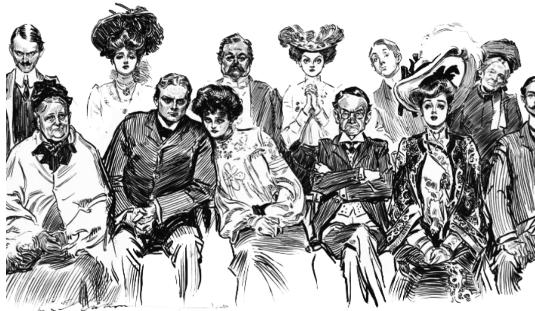
A jury of your peers

I see how I needed every moment of that build up, all of the reinforcement of self that I put into the previous ten years to get me through the experience intact. When the focus of the radical left had moved on to the next crisis, when I hadn't seen my dearest friends in years, when I was puking blood from a mysterious illness with no way to see a doctor, when I didn't even have my own name to give coherence to my words, what I did have to hold onto was the promise I had made to myself—and implicitly to all others engaged in struggle—that I would put everything I had into the fight. Prolonged psychological dissonance can really disorient, subjecting what seems like our strongest foundations to deterioration. Anarchy became the one place to which I could