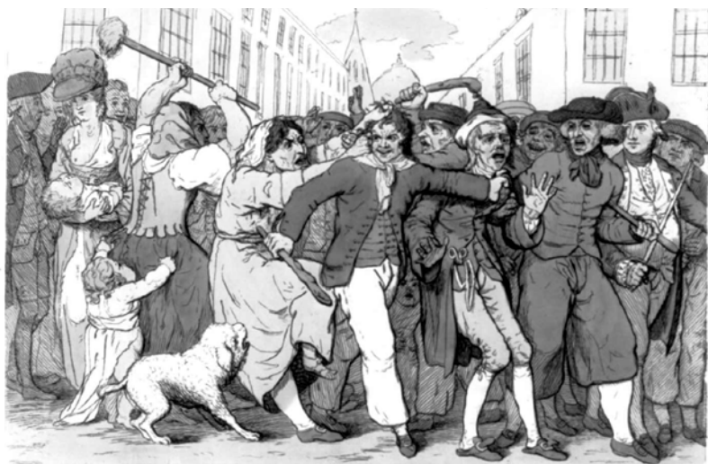
An angry mob takes a stand against impressment during the unruly 1700s.

extraordinary, encompassing more than eighty separate cases of conspiracy, revolt, mutiny, and arson—a figure probably six or seven times greater than the number of similar events that occurred in either the dozen years before 1730 or the dozen after 1742.”