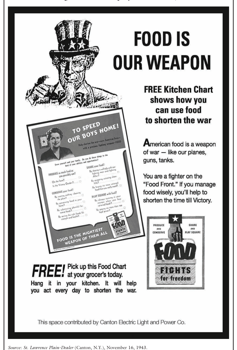
Figure 4 Canton Electric Light & Power Company Advertisement, November 1943