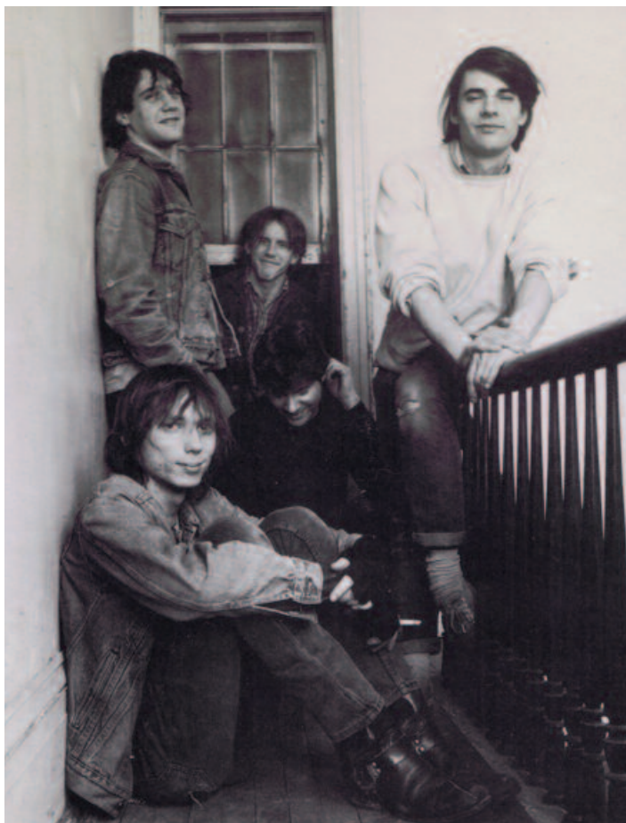
left: 1990 by Stacy Zaferes.