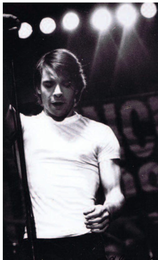
right top and middle: 1992 in Rennes, France.