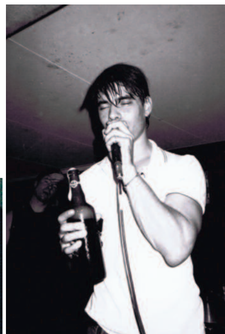
RAUNCH HANDS "BOTTLE NOW" live in NYC at The Bad Music Seminar Nov 1988:

https://www.youtube.com/watch?v=zd8ykLc5Kok