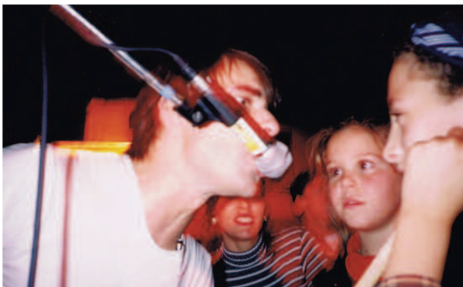
above: 1992, Spain.