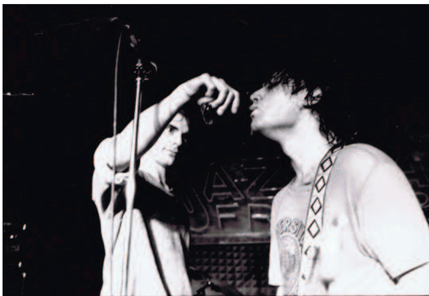
above: Jazzhaus Freiburg, Germany Aug 4 1989