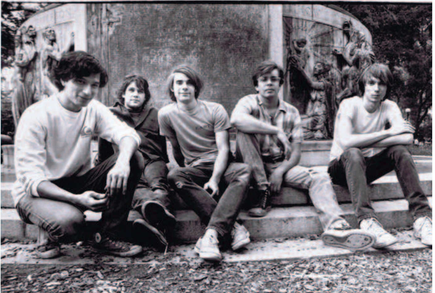
above: 1986, below: May 1986 at Raji's. L. A. below: 1988 lineup