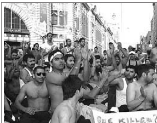
Taxi drivers blockade streets in central Melbourne while on strike in April

International students are a hyper-exploited workforce whether they are studying at MIT, CQU, Sydney University – & it is the 20 hour work restriction that makes it so: firstly because it restricts international student mobility in the labour market to the lowest-paid end of the scale, secondly because the cost of study means that for those who are forced to earn their course fees, there is no question that many will have to breach these restrictions – & risk deportation – to meet their financial obligations to the university.