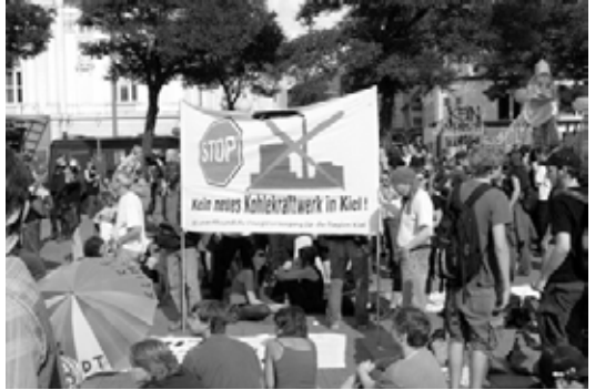
No New Plant in Kiel

For the first time ever in Germany, the Climate and Anti-Racist Camps were held simultaneously in Hamburg 15-24th August 2008. The camps were held together for both practical and political reasons. On the practical side these included shared posters and momentum building, shared workshop spaces, kitchen and toilets.