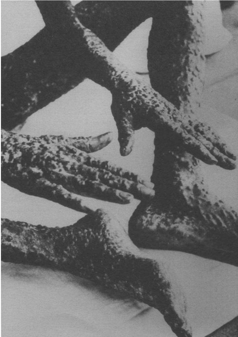
This twentieth-century smallpox patient was photographed in the Ivory Coast. The disease usually left its victims scarred for life. World Health Organization photograph, A014034. Courtesy National Library of Medicine.

Infection with Variola occurred by direct or indirect contact between human beings. There was no animal reservoir for smallpox. Nor was it transmitted by food, water, or a nonhuman vector such as the mosquito. Most often, Variola gained entrance to a potential victim through the respiratory tract, either by direct inhalation or by finger-borne contamination. Transmission could also occur through an open wound in the skin, but with the exception of deliberate cases of inoculation,