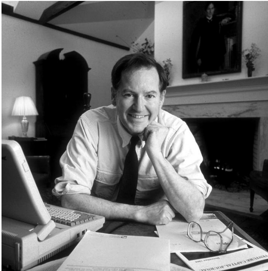
George Gilder in his 1981 book Wealth and Poverty heralded a wave of conservative authors who blame the welfare state for the disintegration of low-income families.

Federal benefits transferred federal payments to the poor, but they also took responsibility for their lives from them. It was a devil’s bargain. The moral lessons most people learn, that they must work and take care of their families if they are to prosper, were blocked for much of the underclass by federal policy. Society normally exacts work or other contributions from its