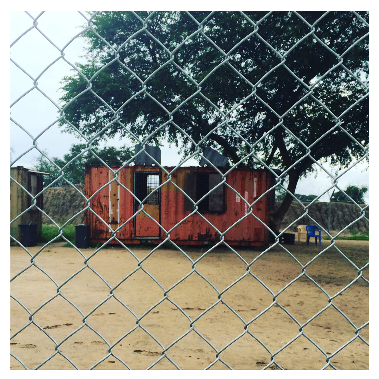
The Holding Facilities at Bor's PoC Site

As new figures of authority with a supporting constituency - and in some cases a tendency to exert their authority through violence – such actors should be treated with caution with regard to arrangements for national and subnational government.