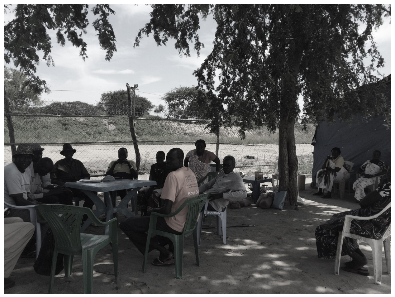
The Court of Elders at the Bor PoC site, with the men seated in an inner circle and woman seated in an outer circle and making tea

after which their recommendations as well as those of the State Level Working Group – comprising the State Coordinator, UNPOL and Corrections, UNMISS Civil Affairs, UNMISS RRP and UN DSS – are forwarded to the Principle Management Meeting at the UN House in Juba, whose recommendations may then be forwarded on to the UN headquarters in New York, where the ultimate decision on whether to authorise the expulsion will occur. That being said, for cases of severe sexual violence, this process can apparently be expedited.