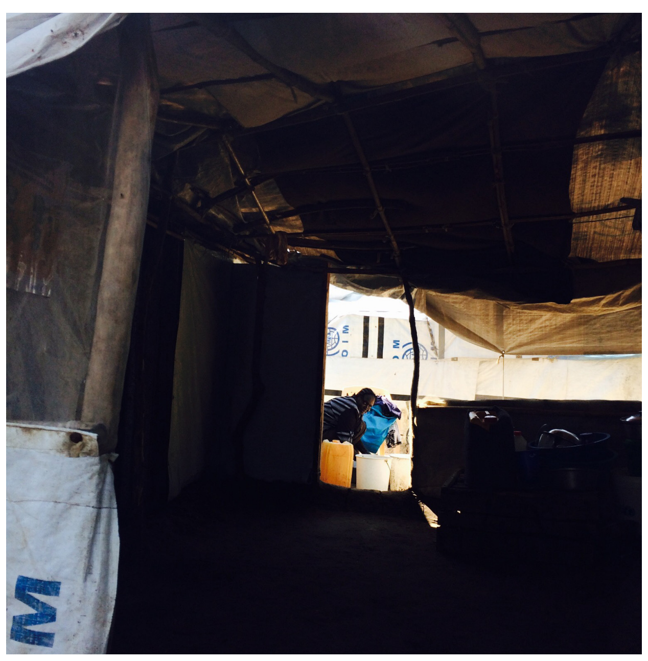
A woman washing clothes under IOM tarpaulin in Bor PoC site

Having uncovered the multitude of forums and actors that exist in South Sudan's PoC sites for those seeking justice and security, we now move on to examine the nature of particular forms of criminality and insecurity, viewed through a range of vantage points, beginning with the provision of humanitarian supplies and services. Thereafter, the prevalence of crime and insecurity are analysed through the lenses of gender, politics, psychosocial trauma and youth gang activity.