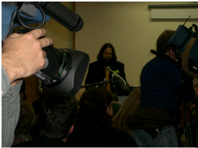
Strong media presence at the launch of first edition of Terror Laws booklet

AMCRAN works through the media to present an Islamic perspective on civil rights issues. Its representatives appear regularly in print, radio and television. AMCRAN has also published several opinion articles in high-circulation newspapers. Its representatives speak at public forums and meetings for both Muslim and non-Muslim groups on diverse topics such as "Integration or Isolation" and "Terror Laws and the Muslim community: where does terror end and where does security begin?" AMCRAN convenors have also been published in refereed legal journals on the topic of anti-terror laws.