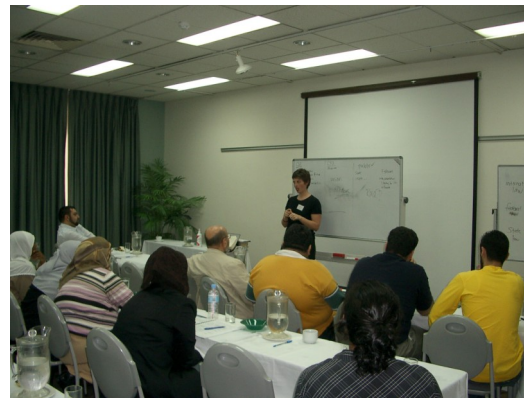
AMCRAN training course on racial and religious vilifications laws to community workers

One of AMCRAN’s major projects has been the publication of the series Anti-Terrorism Laws: ASIO, the Police and You , in cooperation with the UTS Community Law Centre and the New South Wales Council for Civil Liberties. The booklets explain people’s rights and responsibilities under Australia’s anti-terrorism legislation. The first edition was launched in June 2004. Four thousand copies were produced and distributed at various events to organisations and individuals all around Australia. Thanks to project funding from the Law and Justice Foundation and the UTS Students Association and UTS Law Faculty, the latest edition has been translated into three community languages: Arabic, Bahasa Indonesia and