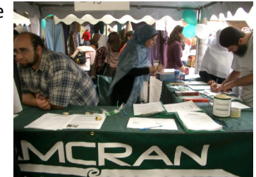
AMCRAN MEFF stall

In addition to the publications, AMCRAN conducts community legal education sessions that