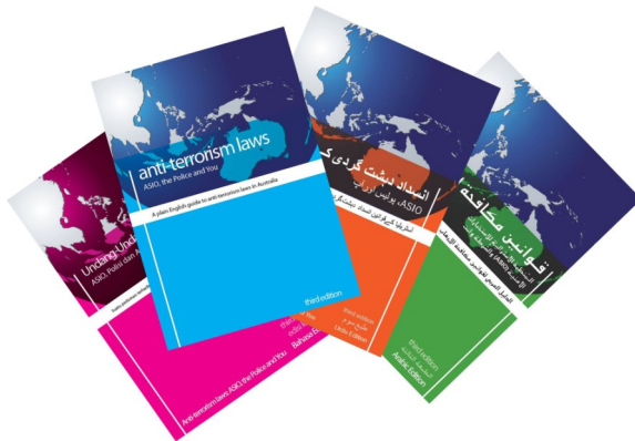
AMCRAN third edition series Anti-Terrorism Laws, ASIO, the Police and You