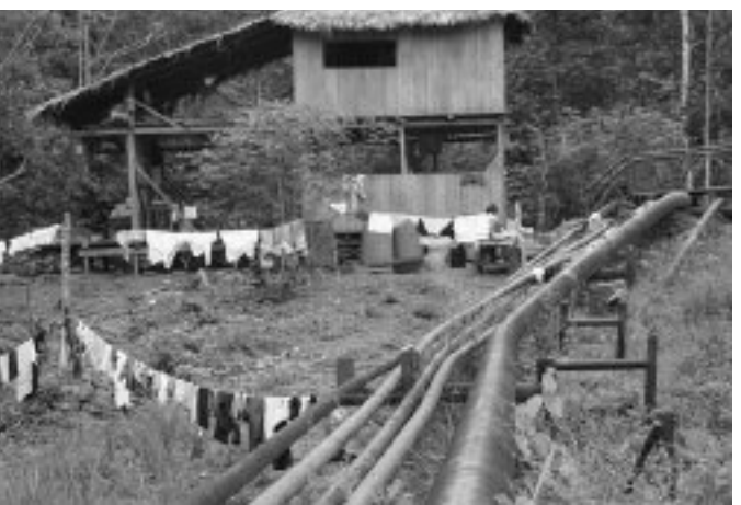
A pipeline passes a traditional house in Yasuní National Park Ecuador