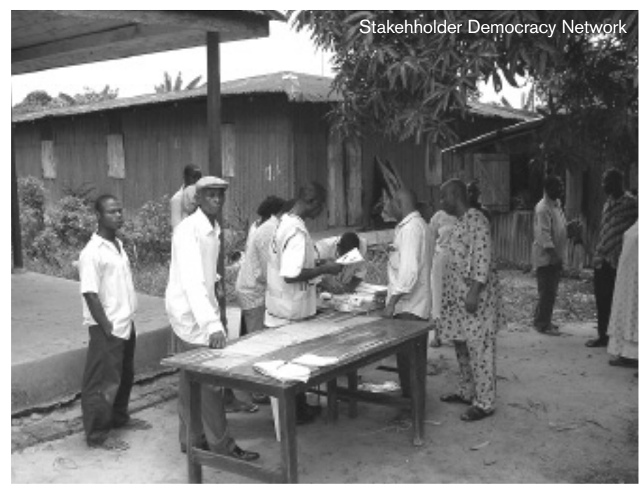
Nigerians queue at the polls during April's elections