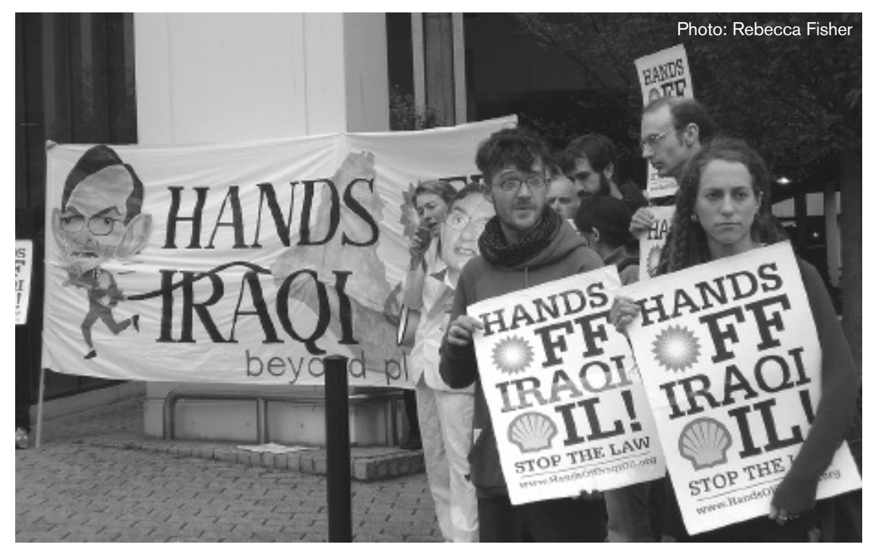
Demonstrators at last month's Shell AGM demanded 'Hands Off Iraqi Oil'

www.handsoffiraqioil.org Oil Change International: www.priceofoil.org