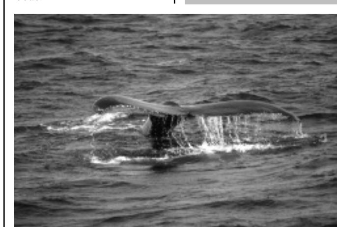
Shell's Sakhalin II project threatens the Western Pacific Grey Whale with extinction.