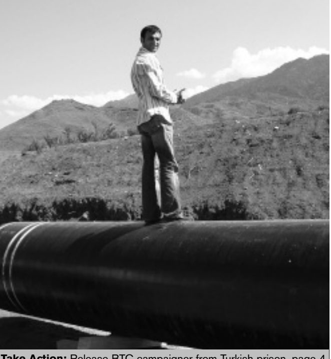
Take Action: Release BTC campaigner from Turkish prison, page 4

As early as May 2004, ex-BOTAS contractors leaked information about the poor state of construction work. PLATFORM spoke to more than ten engineering specialists who had worked on the project, who cited falsification of records, the application of incorrect materials, inadequate safety precautions and suppression of internal concerns amongst other problems. Whistleblowers described BOTAS as "out of control", with BP unable or unwilling to push BOTAS to comply with international standards, preferring to prioritise its economic interest in having the project delivered