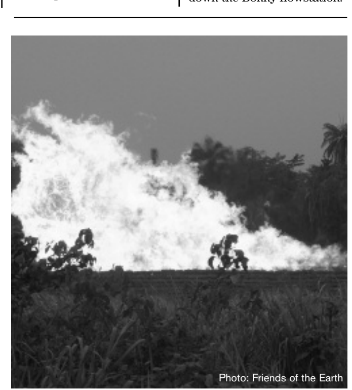
Flares burn day and night in Nigeria, "Shell is contemptuous of our laws, of our peoples and of our environment. We are ashamed that our government is in an unholy wedlock with a corporation such as this." Reverend Nnimmo Bassev of Environmental Rights Action.

The company's Nigerian production was set back at the end of December by a dynamite attack on a pipeline. Damage to pipelines is not unusual in Nigeria but last month's attack hit 200 000 barrels per day of Nigerian exports and pushed up global oil prices. Shell declared force majeure (a legal term allowing a party to a contract to breach its terms) and shut down the Bonny flowstation.