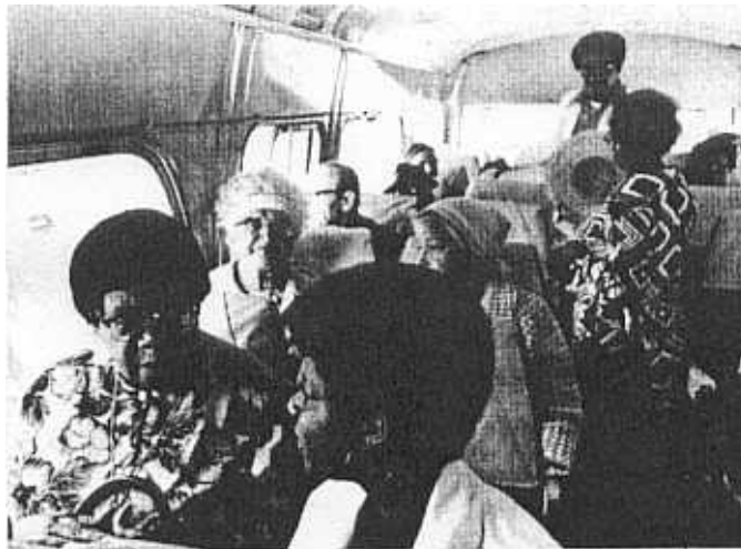
Senior citizens aboard free transportation provided for their many errands.