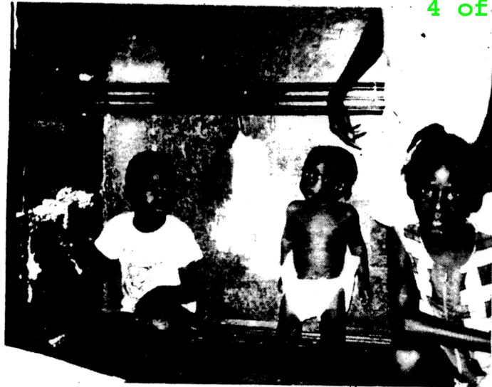
Every mother wants a decent place to live for her children.