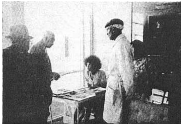
The S.A.F.E. program serves the needs of elderly people, a segment of American society sadly neglected.

Album produced and distributed by MOTOWN RECORD CORP