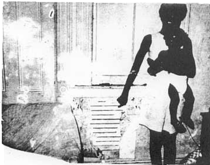
No mother wants her children to play in places like this.