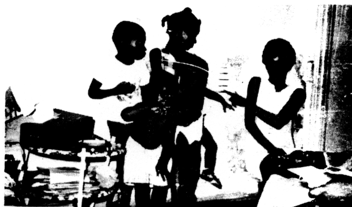
The U.S. government doesn't care about Black children.

The Black community is constantly plagued by diseases that stem directly from our unique form of oppression within America. Since our migration from the South to the East and West, we have always been forced, because we are poor, to live under the most degrading, dehumanizing conditions. Very often the buildings we live in are crumbling havens for rats, roaches and exposure to the heat and cold. Anemia and malnutrition are everyday occurrences, due to our inadequate diets. Often the buildings we are forced to live in are twenty to thirty or fifty years old. The paint used in buildings in those days was high in lead content (part of the paint base). Quite often slumlords today will paint over the lead-based paint, rather than scrape it off. As the thin layer of lead-free paint wears off and the old paint begins to peel, small children are often attracted to it, because of its softness and sweet taste. They usually pick this paint from walls and eat it. A child need only eat two or three flakes of paint for three months to accumulate a lethal (deadly) dose. One small chip of this old paint can contain 100 milligrams of lead. Enough chips can result in lead poisoning.