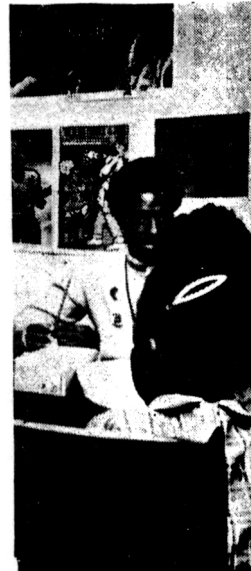
Omaha Liberation School

Since its opening last Wednesday, our Liberation School has definitely been functioning well. The children have been responding to instruction with much enthusiasm and eagerness. And it would be interesting to compare the responsiveness of these students taught in the people's school to the responsiveness of students in the Omaha school system. It would be further interesting to compare the attitudes of the Party members who teach Liberation to the attitudes of so many of the teachers hired by the Omaha Board of Education. I believe it is reasonable to say that student interest is an indication of teacher interest and enthusiasm. It is my conclusion, resulting from personal observation and testimony from both students and teachers, that our Black children are generally being taught by teachers who exhibit little real concern for their students and very little enthusiasm. And these teachers lack this enthusiasm because THEY ARE DOING A JOB. They are working for a salary that is paid by an Omaha school system that is aloof from the people's control and unconcerned about the people's needs. The Liberation School instructors are enthusiastic, BECAUSE WE ARE CONCERNED ABOUT THE CHILDREN AND ARE DRIVEN BY THE NEEDS OF THE PEOPLE.