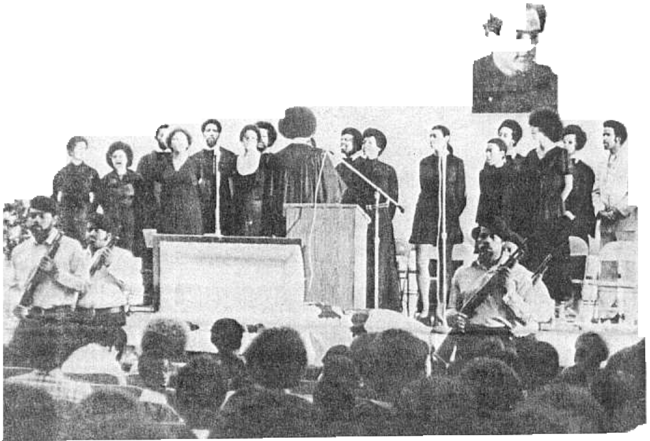
HELD AT SON OF MAN TEMPLE