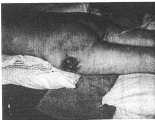
Infection caused by bed sore

of those conditions that exist throughout all of the oppressed communities of the world. In order to destroy these conditions