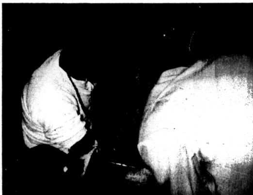
Doctor treating prisoner

The medical conditions at Walla Walla state prison are typical