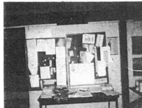
INSIDE OF JERSEY CITY PANTHER OFFICE

Number seven of the Black Panther Party's 10 Point Platform and Program of what we want and what we believe.