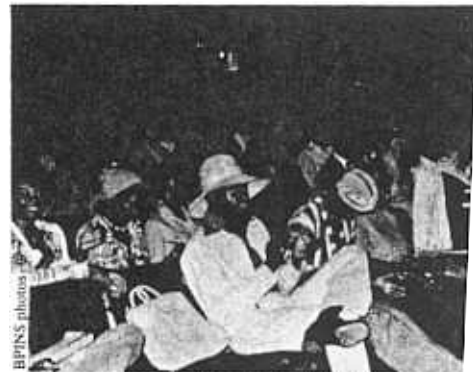
Sister JoANNE LITTLE addressing a crowd at the Oakland Victory Rally. She and the courageous and righteous crowd are to self-c

“When I was in prison for six months, I saw the kinds of conditions human beings are living under: sleeping on cement floors called strip