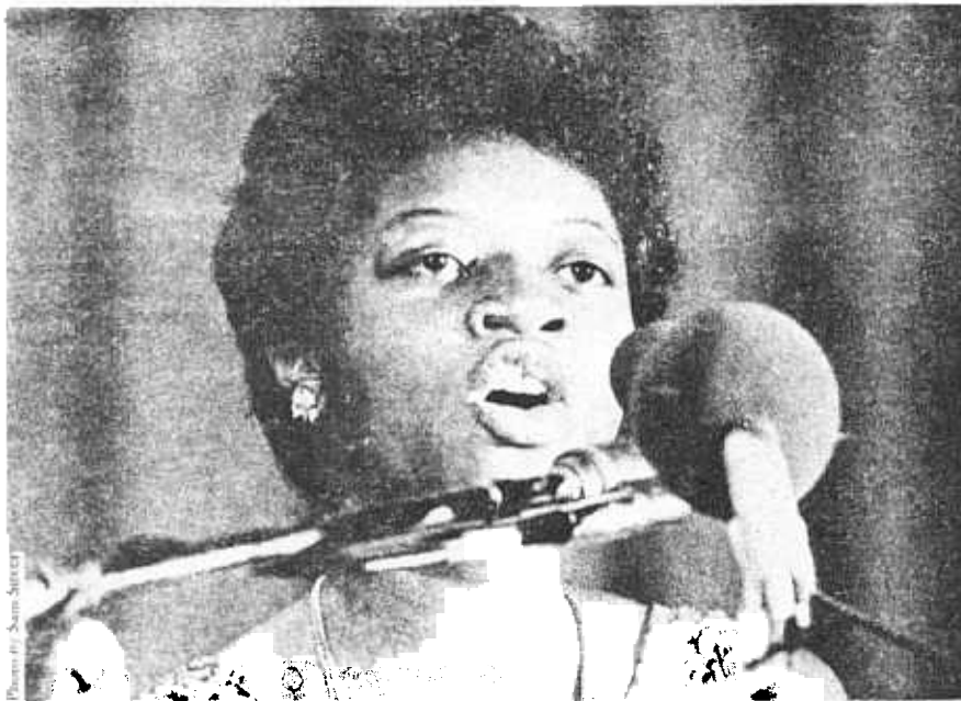
The courageous and beautiful JoANNE LITTLE addressing the crowd who attended her Victory Rally at the Oakland Auditorium Sunday, August 24. Sister JoAnne called for Black people to unify against their oppression, and reminded everyone that she is not yet free nor will anyone be until Johnny Spain, the San Quentin Six, and all political prisoners are free. (For complete text of JoAnne's speech see Centerfold.)

(Oakland, Calif.) - Some 1,200 Oakland and Bay Area residents came out to the Oakland Auditorium on Sunday evening to pay tribute to JoAnne Little at a rousing Victory Rally sponsored by the Black Panther Party.