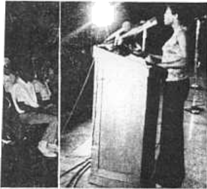
JoAnne Little came to show their support for JoAnne Little; she took to insure women's rights.

"I went to a conference the other day in Sacramento (the California Black Political Education Conference). They had all kinds of big people there who have the power to do something. But half of them aren't doing anything. They're just sitting there. We need Black people who, out of humility, do what is best for Black people because Black people know what is best for our people. When we let the White man stand behind us and dictate over our shoulders about what we should do, then we don't need that position at all.