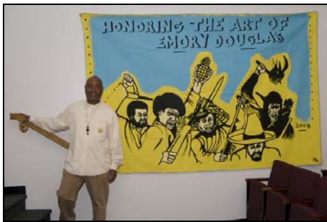
Emory Douglas