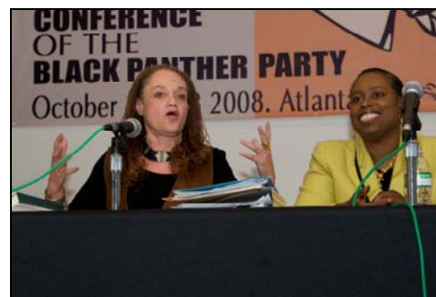
Kathleen Cleaver and Cynthia McKinney