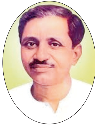
Pt. Deendayal Upadhyaya