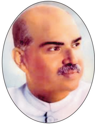
Dr. Syama Prasad Mookerjee