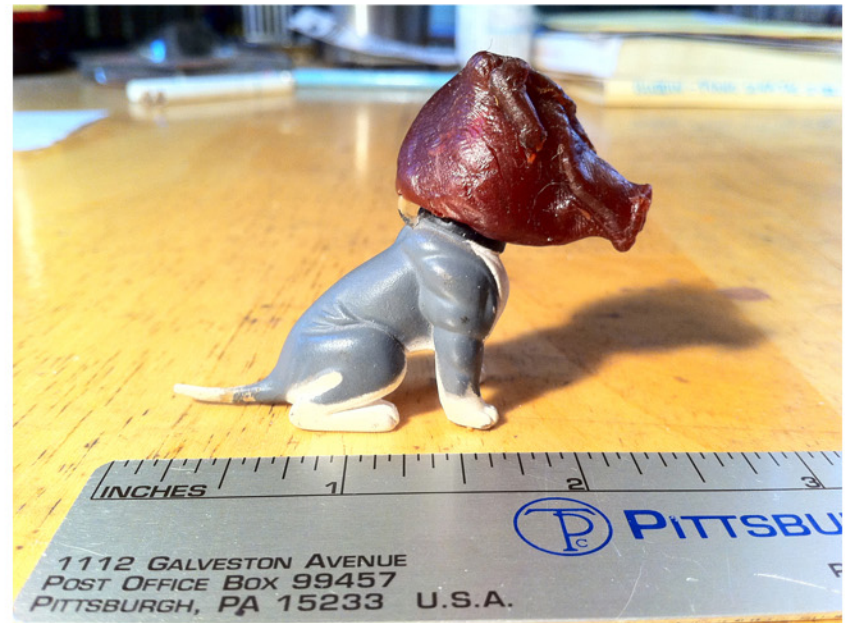
Simon Slater Decorative Sculptures I-VIII