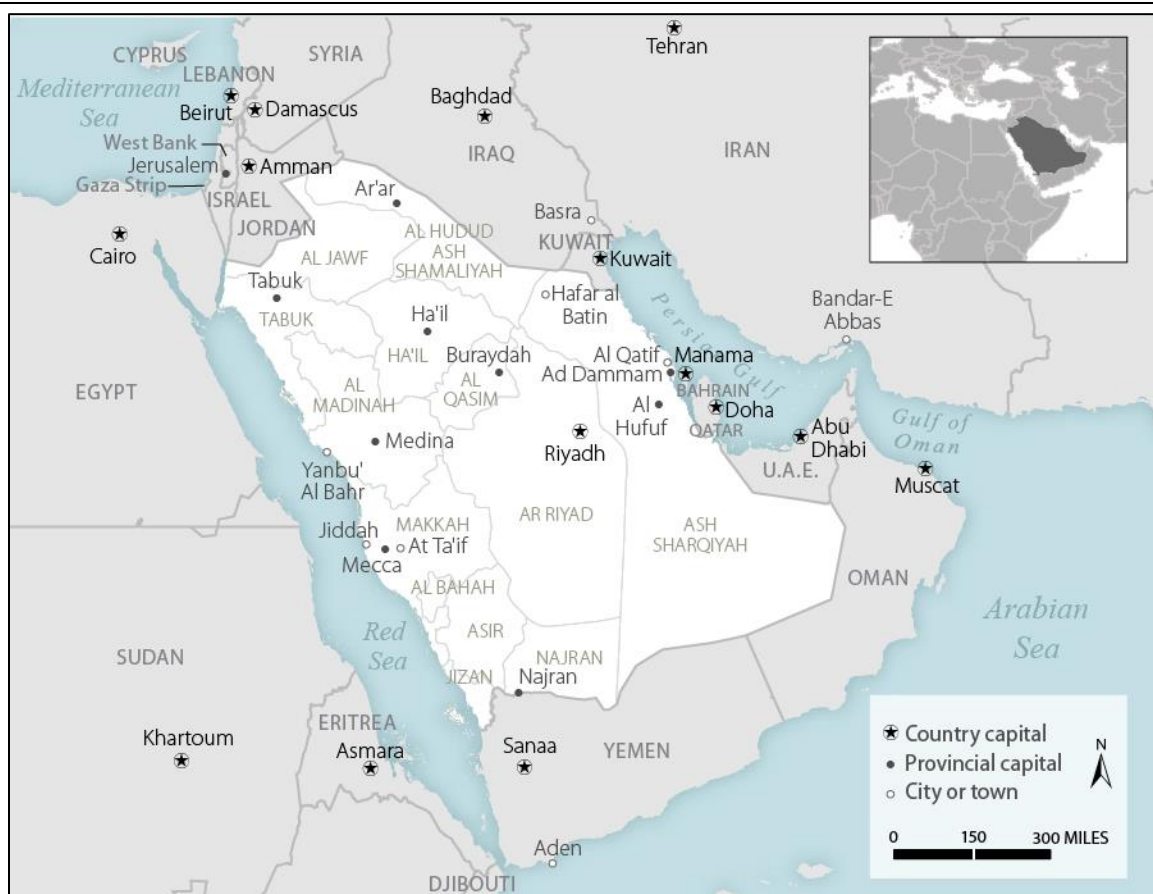
Table I. Saudi Arabia Map and Country Data

Land: Area, 2.15 million sq. km. (more than 20% the size of the United States); Boundaries, 4,431 km (~40% more than U.S.-Mexico border); Coastline, 2,640 km (more than 25% longer than U.S. west coast)