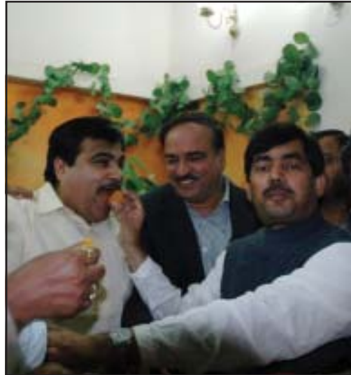
BJP celebrations on Bihar victory

सोलर साइकिल-रिक्शा के प्रदर्शन के अवसर पर