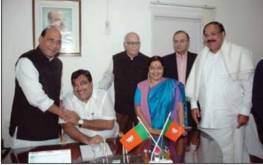
Nitin Gadkariji assumes office as BJP National President at 11 Ashok Road, New Delhi

भाजपा राष्ट्रीय अध्यक्ष नियुक्त होने पर श्री नितिन गडकरी के साथ श्री राजनाथ सिंह, श्री लालकृष्ण आडवाणी, श्रीमती सुषमा स्वराज, श्री अरुण जेटली तथा श्री एम. वेंकैया नायडू