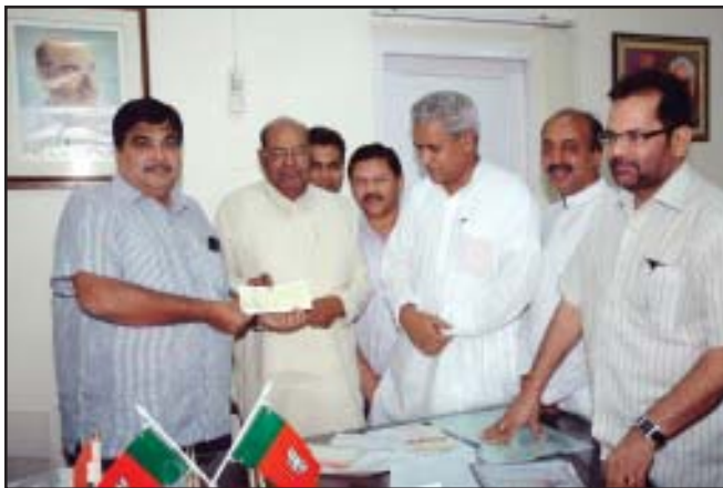
Launching Aajeevan Sankalp Yojana in New Delhi.

नई दिल्ली में आयोजित आजीवन-संकल्प योजना के शुभारम्भ कार्यक्रम में