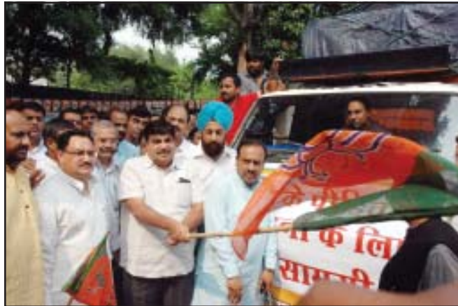
BJP National President Shri Nitin Gadkari flagging off Vehicle carrying Relief Package for flood affected people of Leh (Ladakh).

लेह (लद्दाख) के बाढ़ पीड़ित लोगों के लिए सहायता सामग्री वाहन को झंडी दिखाते भाजपा के राष्ट्रीय अध्यक्ष श्री नितिन गडकरी