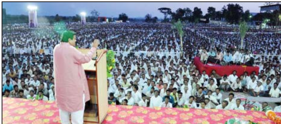
Addressing a farmers gathering at Jamni, Wardha (Maharashtra)