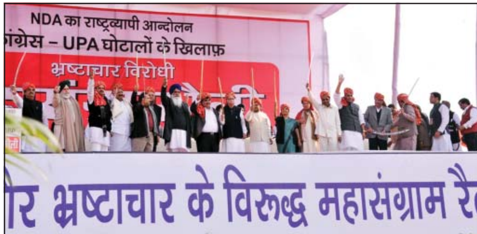
Bhrastachar Virodhi Mahasangram rally in New Delhi

नई दिल्ली में भ्रष्टाचार विरोधी महासंग्राम रैली