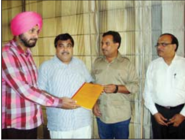
Report on flood-affected areas of Punjab and Haryana submitted to BJP National President Shri Nitin Gadkari

राष्ट्रीय सचिव श्री नवजोत सिंह सिद्धू ने भाजपा राष्ट्रीय अध्यक्ष श्री नितिन गडकरी को पंजाब एवं हरियाणा क्षेत्र के बाढ़ पीड़ितों सम्बंधी रिपोर्ट सौंपी।