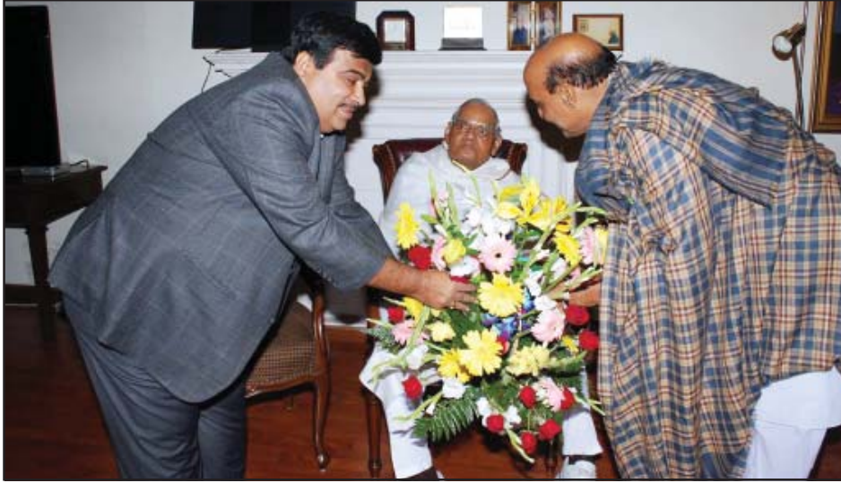
BJP National President Shri Nitin Gadkari and former BJP National President Shri Rajnath Singh seeking blessings from former Prime Minister Shri Atal Bihari Vajpayee at 6A, Krishna Menon Marg, New Delhi

भाजपा राष्ट्रीय अध्यक्ष नियुक्त होने पर श्री नितिन गडकरी के साथ श्री राजनाथ सिंह, श्री लालकृष्ण आडवाणी, श्रीमती सुषमा स्वराज, श्री अरुण जेटली तथा श्री एम. वेंकैया नायडू