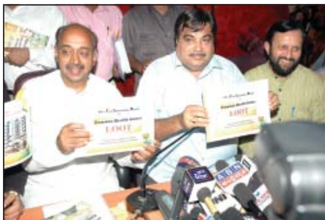
Press conference on Commonwealth Games Loot

कांस्टिट्यूशन क्लब, नई दिल्ली में 'राष्ट्रीय सुरक्षा के लिए बायो-फ्यूल' विषयक राष्ट्रीय सम्मेलन के दौरान