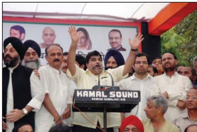
भारत बंद के दौरान श्री नितिन गडकरी