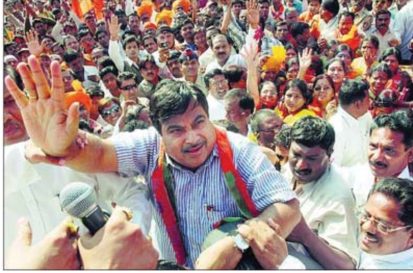
A grand welcome given to Shri Nitin Gadkari at his home town in Nagpur on becoming the National President of BJP

भाजपा के राष्ट्रीय अध्यक्ष का दायित्व ग्रहण करने के बाद अपने गृह नगर नागपुर पहुंचने पर श्री नितिन गडकरी का भव्य नागरिक अभिनंदन हुआ।