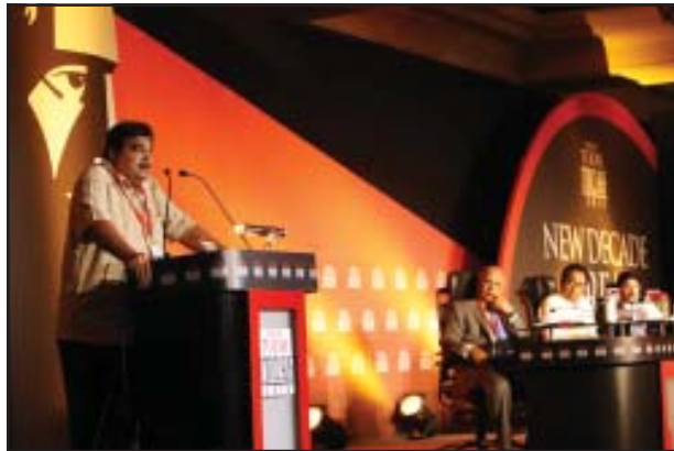
Speaking at 'India Today Conclave 2010'