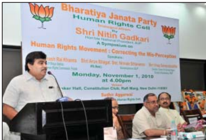
Inauguration of Human Rights Cell

मानवाधिकार प्रकोष्ठ द्वारा आयोजित सेमिनार को संबोधित करते