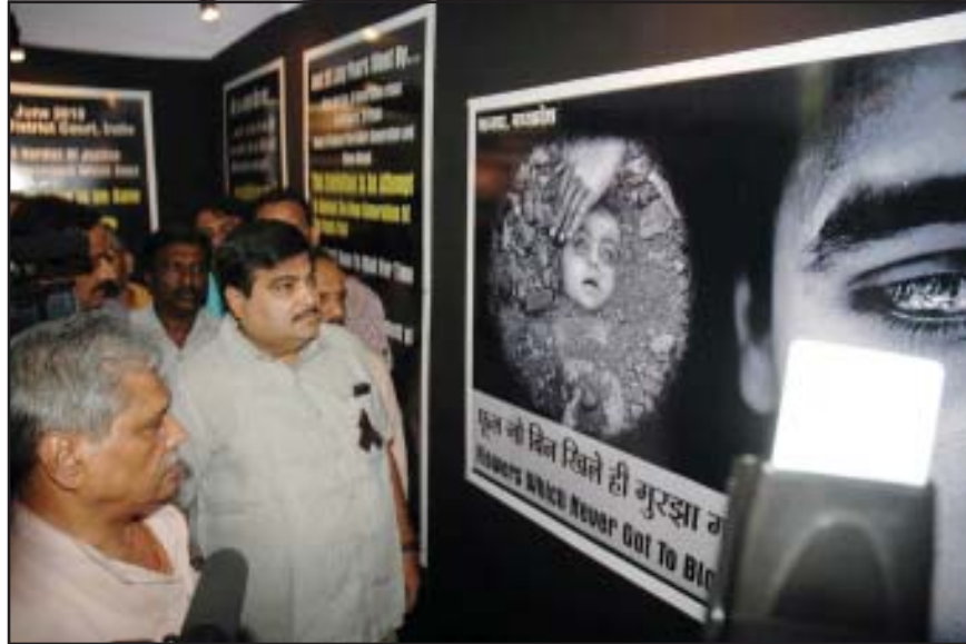
BJP National President Shri Nitin Gadkari in a Virodh Pradarshanion Bhopal Gas Tragedy organised by BJP Madhya Pradesh at Jantar Mantar.

दिल्ली के जन्तर-मन्तर पर भाजपा मध्यप्रदेश द्वारा आयोजित भोपाल गैस त्रासदी सम्बन्धी विरोध प्रदर्शनी के अवसर पर भाजपा राष्ट्रीय अध्यक्ष श्री नितिन गडकरी जी।