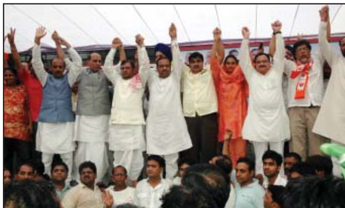
BJP President Shri Nitin Gadkari, NDA Convenor Shri Sharad Yadav during Bharat Band

भारत बंद के दौरान भाजपा राष्ट्रीय अध्यक्ष श्री नितिन गडकरी, राजग संयोजक श्री शरद यादव एवं अन्य