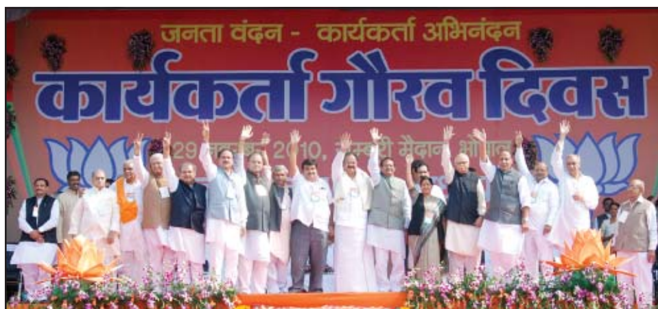
Janta-Vandan, Karyakarta-Abhinandan programme organised on Karyakarta Gaurav Divas at Bhopal in Madhya Pradesh.

रामलीला मैदान, नई दिल्ली में महंगाई के विरुद्ध विशाल रैली