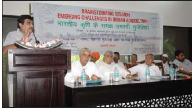
Brainstorming session on “Emerging Challenges in Indian Agriculture” at Speaker Hall, Constitution Club, New Delhi

“भारतीय कृषि के समक्ष उभरती चुनौतियाँ” पर दिल्ली में आयोजित कार्यशाला।