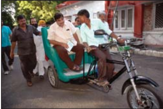
Demonstration of solar cycle-rickshaw

सोलर साइकिल-रिक्शा के प्रदर्शन के अवसर पर