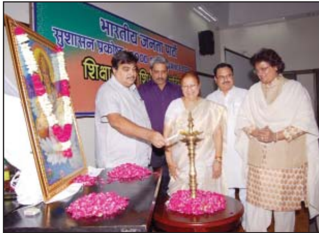
BJP ruled state Education Ministers conference at Constitution Club in New Delhi

कांस्टिट्यूशन क्लब, नई दिल्ली में आयोजित भाजपा शासित राज्यों के शिक्षा मंत्री सम्मेलन का उद्घाटन करते।