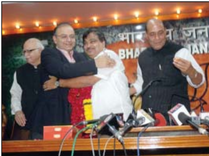
19 दिसम्बर 2009 को श्री नितिन गडकरी को भाजपा राष्ट्रीय अध्यक्ष नियुक्त किए जाने पर पार्टी मुख्यालय के तीन दृश्य— (1) श्री लालकृष्ण आडवाणी एवं पूर्व राष्ट्रीय अध्यक्ष श्री राजनाथ सिंह द्वारा उनका अभिनन्दन; (2) आडवाणी जी द्वारा मिष्ठान्न से मुँह मीठा कराते हुए तथा (3) श्री अरुण जेटली द्वारा उन्हें गले लगाते हुए।