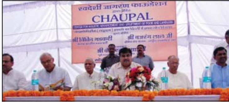
Chaupal organised by Swadeshi Jagran Foundation

स्वदेशी जागरण फाऊंडेशन द्वारा आयोजित चौपाल के दौरान