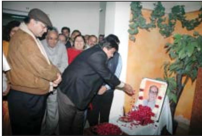
Flower tributes to Shri Kushabhau Thakre

संगठन शिल्पी श्री कुशाभारु ठाकरे के चित्र पर पुष्पांजलि अर्पित