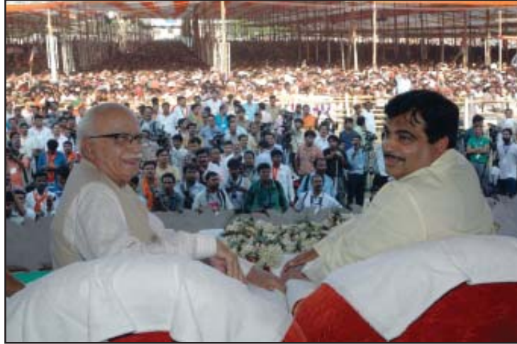
गांधी मैदान पटना (बिहार) में भाजपा रैली