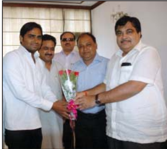
BJP National President Shri Nitin Gadkari congratulating Newly Elected ABVP office bearers of DUSU - Delhi