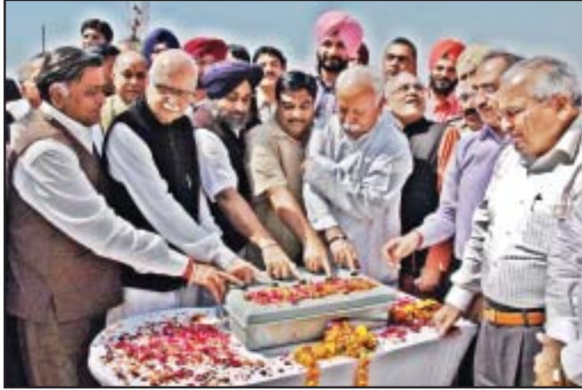
Unveiling the statue of Dr. Shyama Prasad Mukherjee at Madhopur (Pathankot) Punjab

माधोपुर (पठानकोट), पंजाब में श्री श्यामा प्रसाद मुकर्जी की मूर्ति के अनावरण समारोह में।