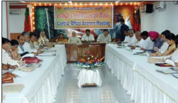
भाजपा केन्द्रीय पदाधिकारी बैठक का एक दृश्य