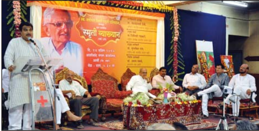
Smriti Vyakhyan programme in the memory of Shri Dattopanth Thengdiji at Aashirwad Karyalaya, Aarvi, Dist. Vardha, Maharashtra

आशीर्वाद कार्यालय, आरवी, वर्धा जिला, महाराष्ट्र में स्व. श्री दत्तोपंत ठेंगड़ी की स्मृति में आयोजित कार्यक्रम के अवसर पर व्याख्यान देते।