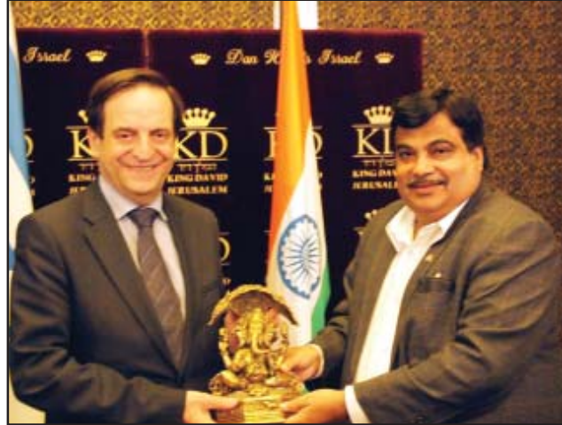
Mr Gadkari presenting Ganesh Idol to Deputy Prime Minister of Israel Mr. Dan Meridor in Jerusalem

श्री गडकरी ने जेरुसलम में इस्त्रायल के उप-प्रधानमंत्री श्री डान मेरीडोर को गणेश की मूर्ति भेंट की।