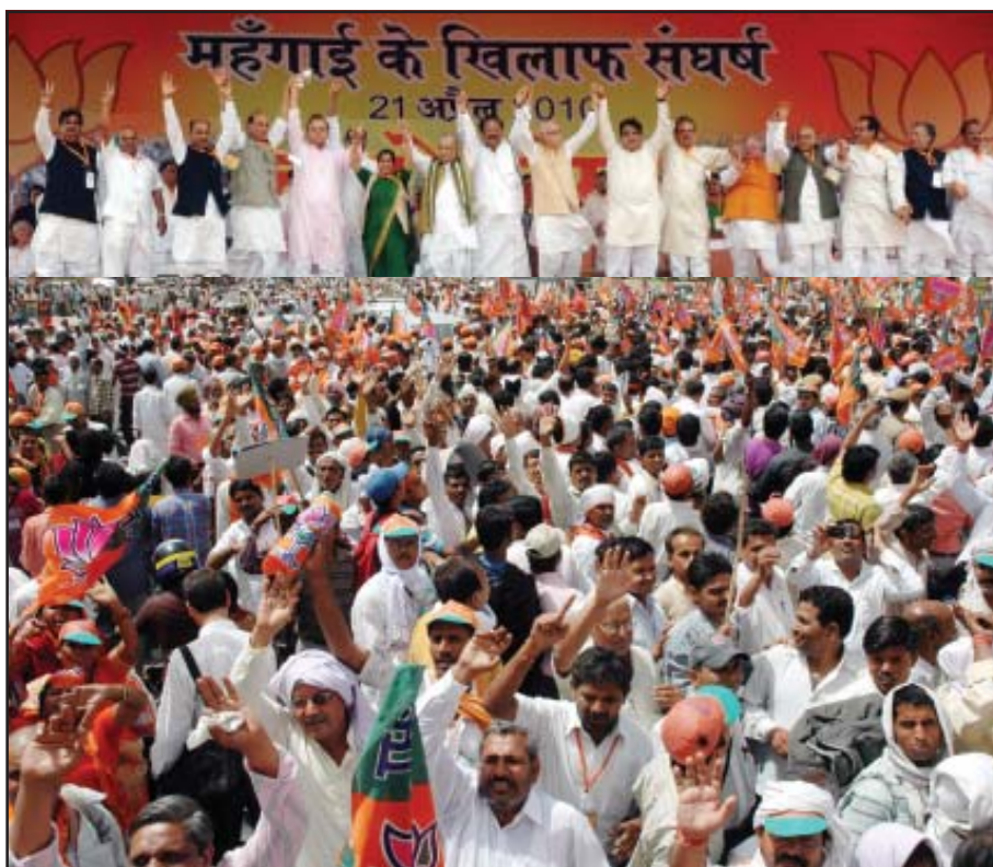
Massive BJP Rally against mehngai at Ramlila Ground in New Delhi

रामलीला मैदान, नई दिल्ली में महंगाई के विरुद्ध विशाल रैली