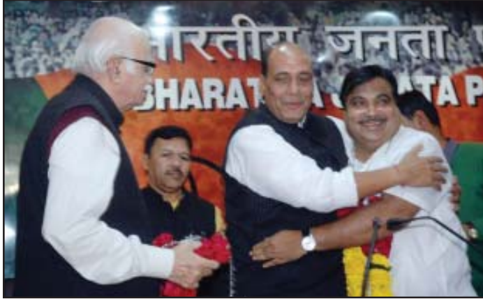
Shri Nitin Gadkari on being appointed as BJP National President at 11 Ashok Road New Delhi, on December 19, 2009