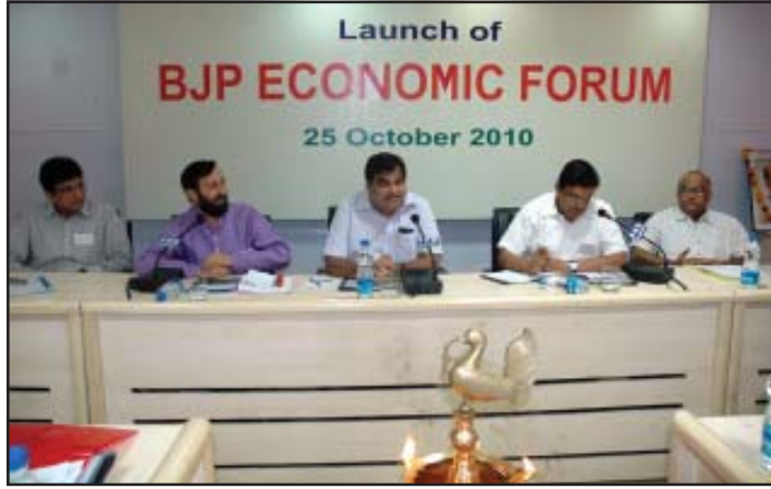
The inauguration of BJP Economic Forum