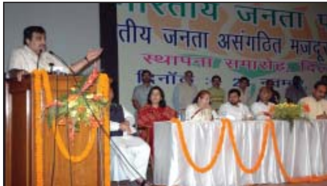
Seminar on unorganised sector workers at FICCI auditorium.

कांस्टिट्यूशन क्लब, नई दिल्ली में आयोजित भाजपा शासित राज्यों के शिक्षा मंत्री सम्मेलन का उद्घाटन करते।