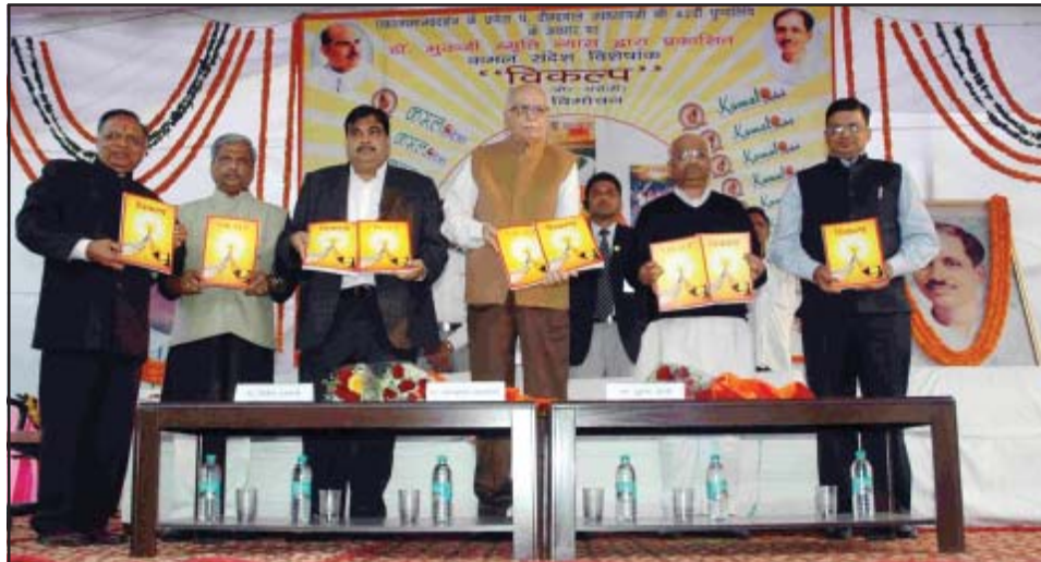
Releasing special issue of Kamal Sandesh 'Vikalpa' at Dr. Mookerjee Smruti Nyas, New Delhi.

दिल्ली के जन्तर-मन्तर पर भाजपा मध्यप्रदेश द्वारा आयोजित भोपाल गैस त्रासदी सम्बन्धी विरोध प्रदर्शनी के अवसर पर भाजपा राष्ट्रीय अध्यक्ष श्री नितिन गडकरी जी।