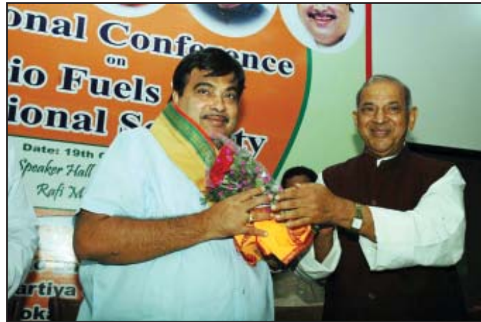
National Conference on "Bio-fuels for National Security" at Constitution Club

कांस्टिट्यूशन क्लब, नई दिल्ली में 'राष्ट्रीय सुरक्षा के लिए बायो-फ्यूल' विषयक राष्ट्रीय सम्मेलन के दौरान