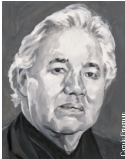
Justice Murray Sinclair

Textbook portrayal of the North American Indian was distorted, denigrative, inaccurate, and incomplete. They were presented as blood-thirsty war-mongers, hostile savages and drunken