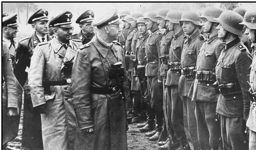
Heinrich Himmler (Nazi SS Reichsfuehrer and head of the Gestapo) inspecting the Waffen-SS Galicia Division on June 3, 1944.

While the 1945 armistice ended WWII, it did not stop the war against communism that the Nazis had spearheaded. Although Canada’s Soviet allies suffered 30 million deaths, and the Red Army was instrumental in defeating fascism, the USSR and