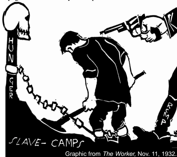
Graphic from The Worker , Nov. 11, 1932.