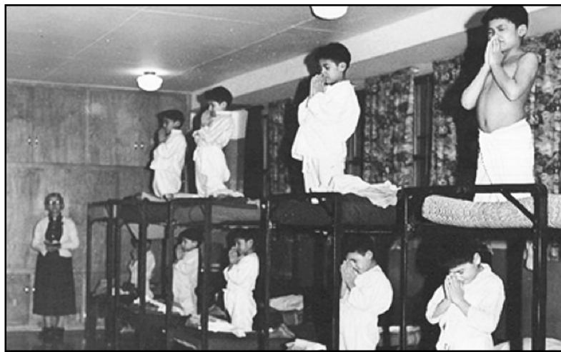
Anglican residential school, Moose Factory, James Bay, 1950.

“were generally moderately left of centre, but included such mainstream figures as W.L.Mackenzie King, who ... was influenced by social gospel ideas in his popular 1919 book, Industry and Humanity .” 8