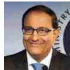
Mr. S Iswaran

“ Japan is incomplete without India, India is incomplete without Japan. ”