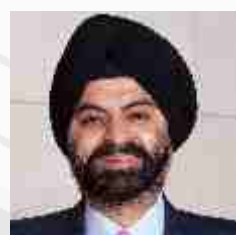
Mr. Ajaypal Singh Banga

“ We will be continuing to expand our business in the state with investments worth 20,000 crores ”