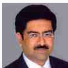
Mr. Kumar Mangalam Birla