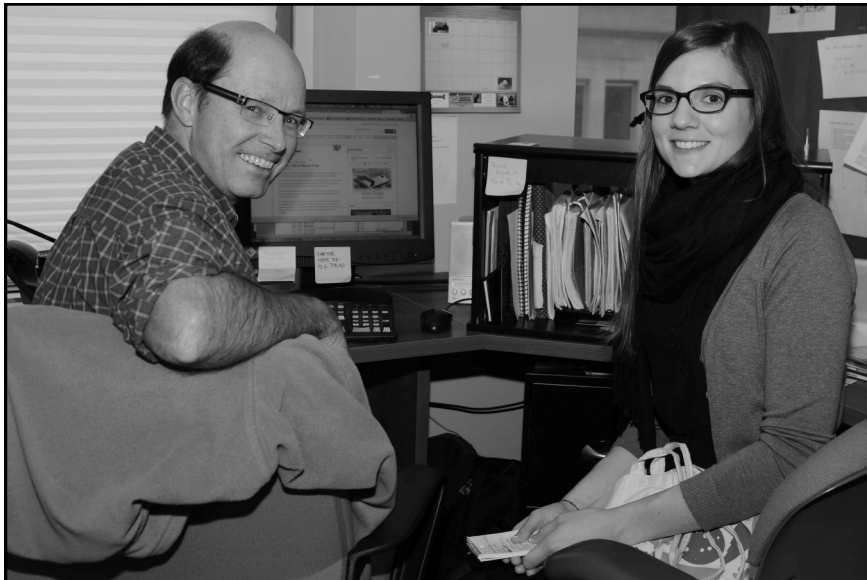
Fall 2013

ALL VOLUNTEERS AND STAFF WILL BE HELD TO THE RULES OF CONDUCT AND TERMS OF SERVICE LISTED ABOVE.