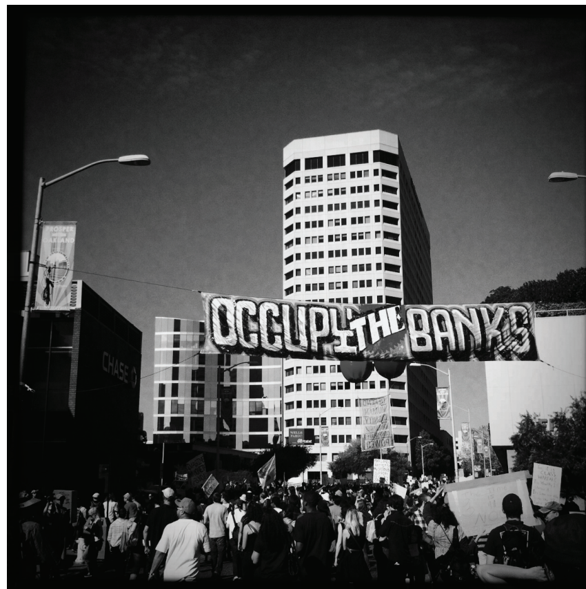
Image from the Oakland General Strike 11/2/11.

Dancing with Dynamite deals with the dances between today’s nominally left-leaning South American governments and the dynamic movements that helped pave their way to power in Bolivia, Ecuador, Argentina, Uruguay, Venezuela, Brazil, and Paraguay. The discussion surrounding the question of changing the world through taking state power or remaining autonomous has been going on for centuries. The vitality of South America’s new social movements, and the recent shift to the left in the halls of government power, make the region a timely subject of study within this ongoing debate. Though often overlooked in contemporary reporting and analysis on the region, this dance is a central force crafting many countries’ collective destiny.