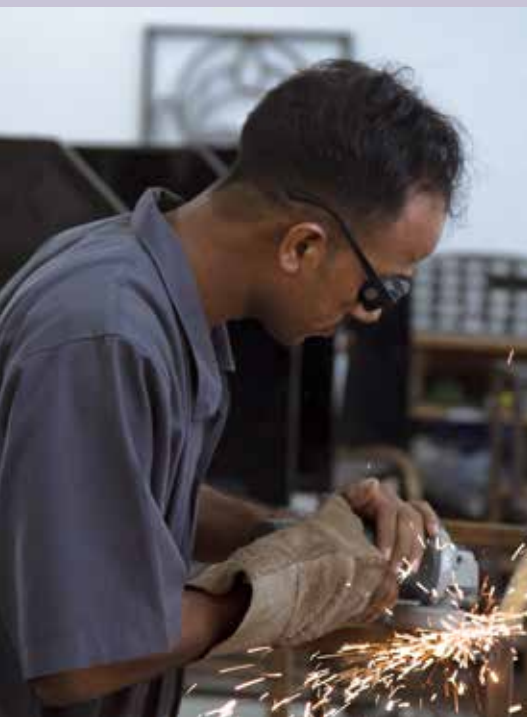
NEEV: IITGN's community outreach programme.

Our goal is that children of every member of the IITGN community should have access to decent education to realize their full potential.