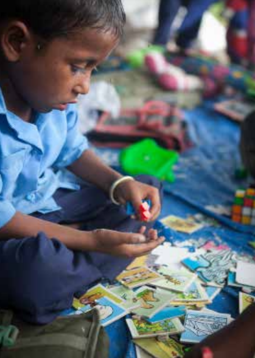
Nyasa: IITGN's community outreach programme.

Our goal is that children of every member of the IITGN community should have access to decent education to realize their full potential.