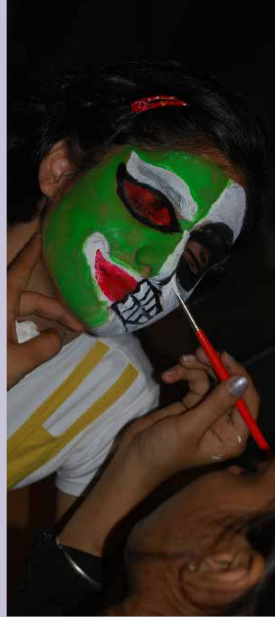
Bliethchron, student cultural festival.

Land was procured in July 2012, construction contracts were awarded in July 2013 and classes in the new campus began in July 2015. Built in record time, the campus is already being recognized for its path-breaking initiatives in sustainable development. It has won multiple HUDCO design awards, the most recent being a first prize in 2016 in the Green Buildings category for its academic complex. Ours is the first campus in the country to receive a five-star rating in the GRIHA (India's national green buildings rating system) Large Developments category for its masterplan design.