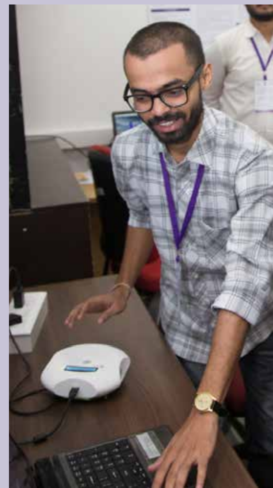
One Touch Doctor system for noninvasive measurement of various physiological parameters.

The Institute has developed a unique five-week Foundation Programme aimed at orienting incoming undergraduate students towards a holistic education that develops a broad set of life skills.