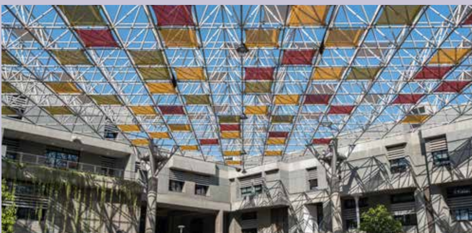
The fabric pattern in Samvad inspired from the kite flying traditions in Gujarat