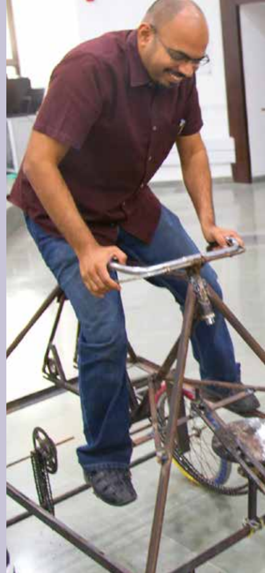
A working prototype for agricultural operations; part of the Synthesis and Analysis of Mechanisms course.

In a very short span of its existence, IITGN has developed an enviable reputation in educational circles for its innovations in curriculum and governance, some of which are outlined in the following pages.