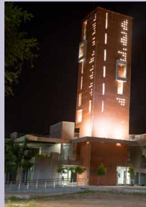
Lal Minar view at night