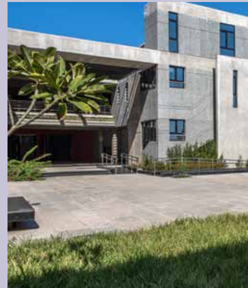
Academic building 2 auditorium