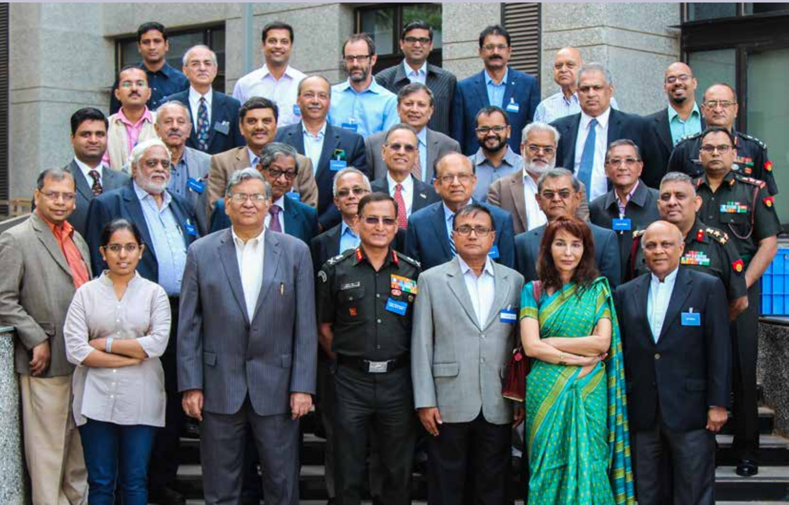
Group photo of the Leadership Conclave 2016.

Public-Private Partnership: Since its inception, IITGN has worked towards a model in which public funds are utilized for routine capital and operating expenditures, while private funds are applied to nurturing and supporting excellence (wherever it is not possible through public funds). The Institute has raised major private donations in addition to commitments for significantly larger donations in the future. These funds are utilized to provide unprecedented financial support and incentives to outstanding faculty and students. Very early in the Institute's existence, well wishers of the Institute set up a tax-exempt Foundation in the United States to support the Institute in its endeavours to seek private funds abroad.