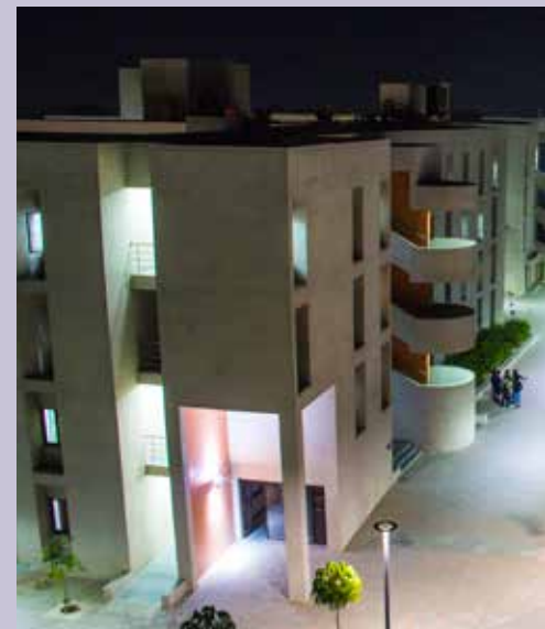
Night view of hostels