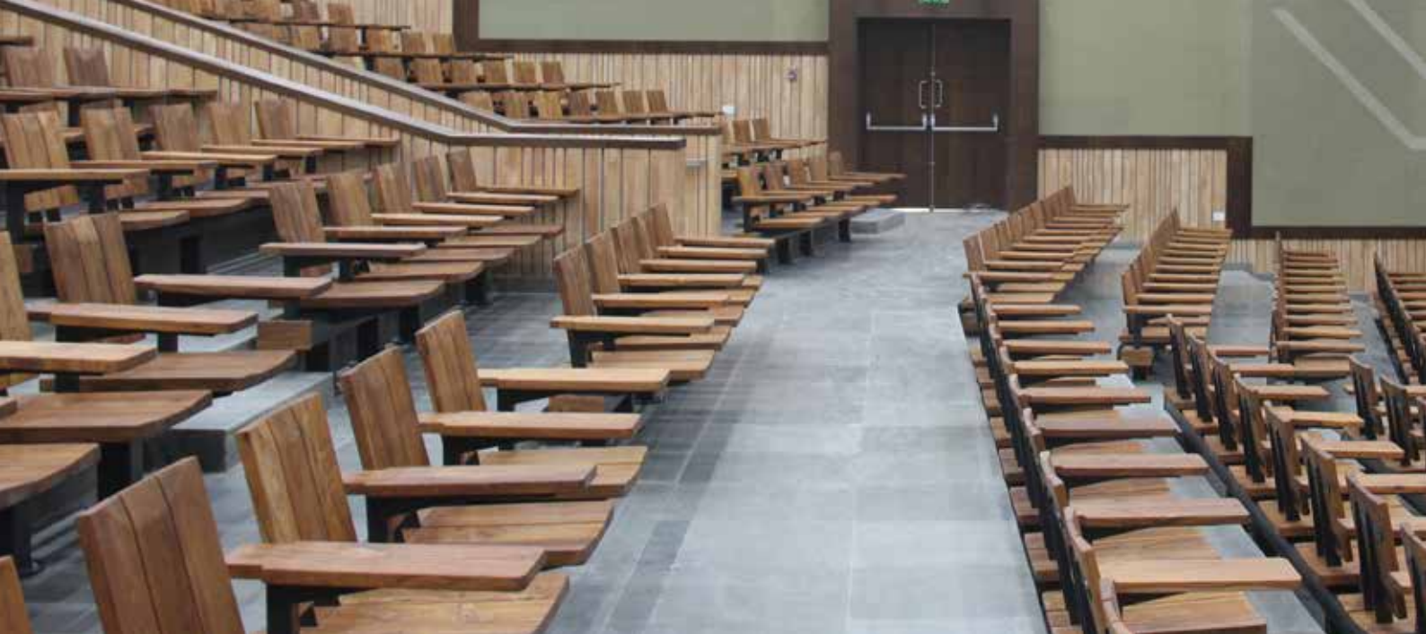
Jasubhai Memorial Auditorium