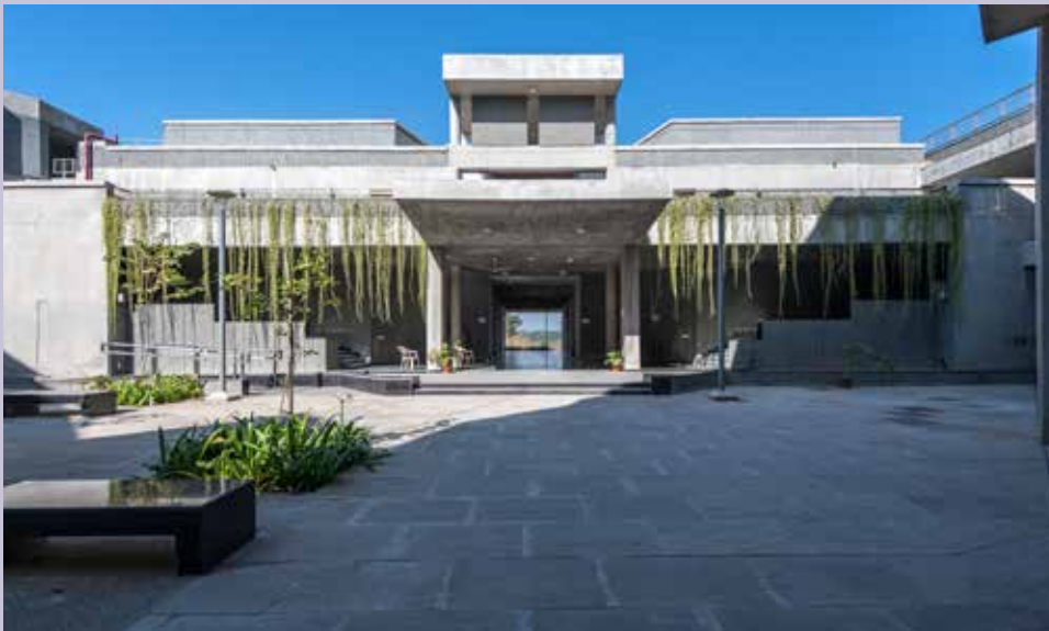
Academic Building 1 auditoriums