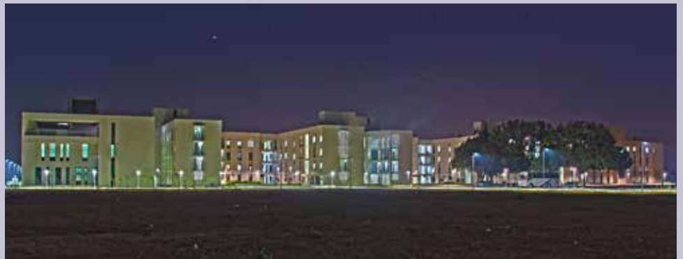
Night view of hostel