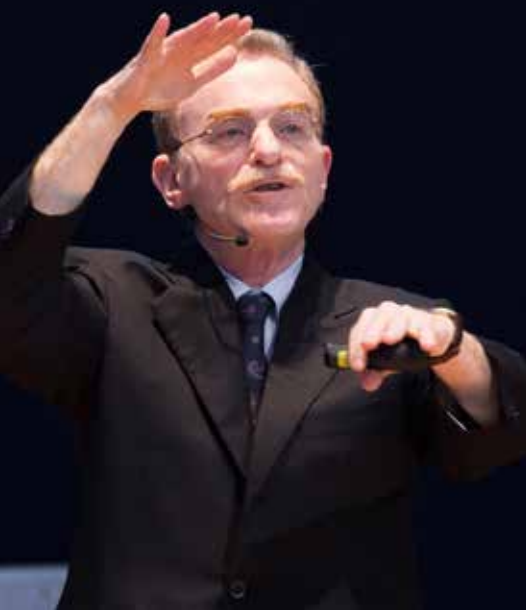
Nobel Laureates, Prof Harold Varmus & Prof Randy W Schekman, speaking at the Institute on Jan 11, 2016.