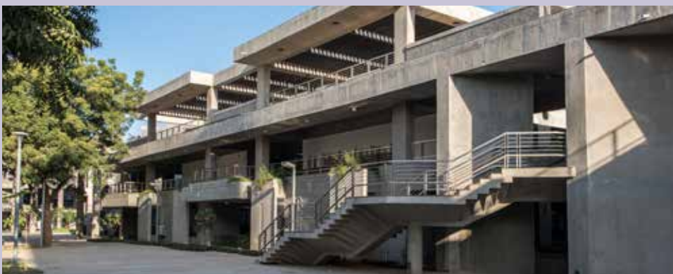
Entrance to Academic complex from hostel