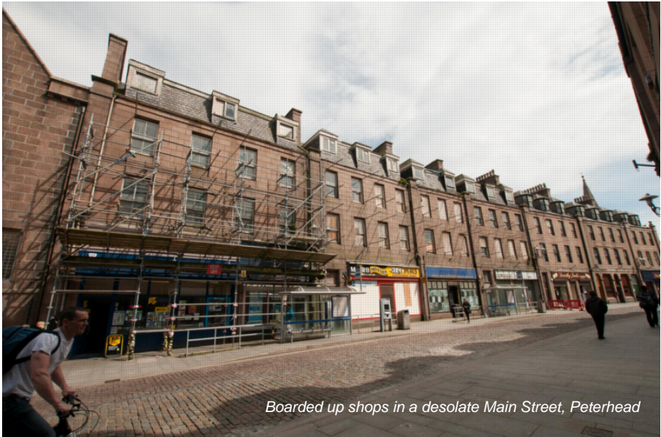
Boarded up shops in a desolate Main Street, Peterhead

We, however, have borne the brunt of the folly of the CFP. How do you think the residents of Peterhead feel when, after being Britain's premier fishing port 20 years ago, the town has become desolate with empty shops and a harbour with hardly any Scottish vessels? Meanwhile, money is being spent to deepen the harbour to accommodate Spanish and French vessels using it as a transit point.