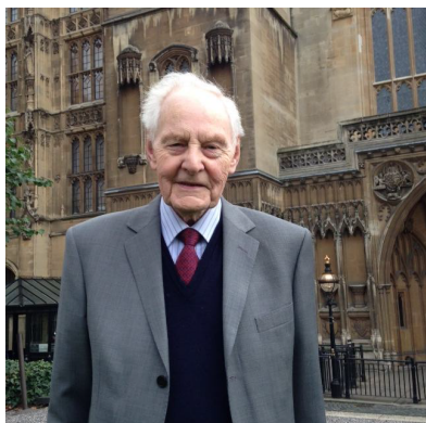
Lord Stoddart of Swindon