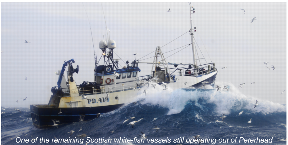
One of the remaining Scottish white-fish vessels still operating out of Peterhead

A rejection of the deceit and spin which David Cameron will use to persuade us to stay hitched to this catastrophic project will send out a powerful signal to our politicians: our country deserves better; mend your ways; we have had enough.