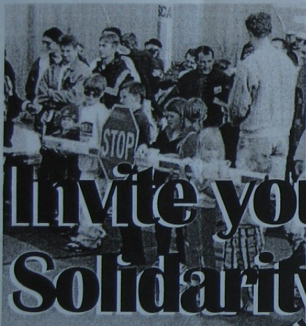
East Swanson Dock Picket, 1998

With the endorsement of Textile Clothing and Footwear Union of Australia Victorian Trades Hall Council Industrial Workers of the World