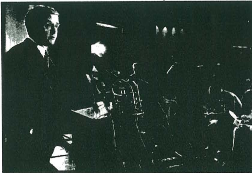
Henry Holt & Co.

School, Brewster won a debate against Groton's McGeorge Bundy, Bundy's brother Bill and FDR Jr., arguing that "capitalism is more conducive to war than socialism," but he soon concluded that the center, with good leadership, can be tempered by the extremes raging at its margins. As Yale undergrads in the late 1930s, Brewster and Bundy split over new intervention in Europe, Brewster believing that America's republican experiment had miscarried so badly abroad that internal reform must precede foreign ventures. Many of his classmates shared his "America First" instincts, not out of pro-Nazism but out of a conviction that American elites had failed the republic and should concentrate