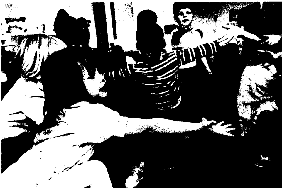
DAY CARE CENTER, TEXAS, 1990

bivalence about it. Nor, surely, did Baker's "better" characterize extenuated rationalizations of Ebonics, gangsta-rap celebrations of black self-immolation, or widespread black support for O. J. Simpson's acquittal and the "black" jurisprudence and epistemology invoked to excuse it.