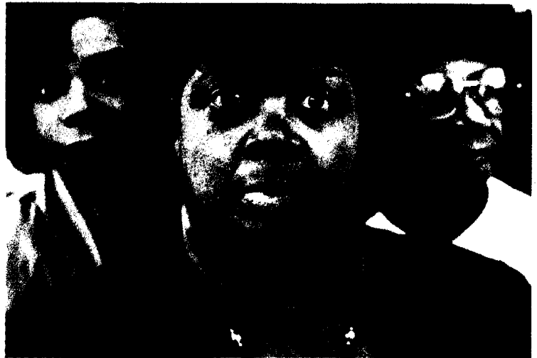
LINDA BROWN ( BROWN V. BOARD OF EDUCATION ), 1995