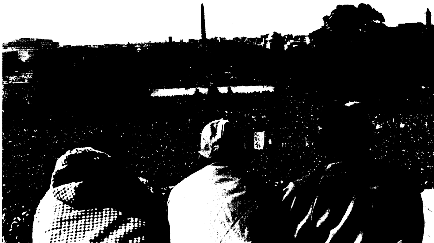
MILLION MAN MARCH, WASHINGTON, 1995

whose religion, myths, and current interests have little in common with those of my Jewish "tribe," which they drove out or exterminated in the 1940s. American Afrocentrists (and liberal whites) seeking a romantic, Pan-African foil to a racist America found the same "ethnic cleansing" furiously under way in Nigeria, Rwanda, Zaire, and the Sudan. The very designation "black" was no more useful a moral, political, or cultural identification than is "white" in Lithuania or the Balkans.