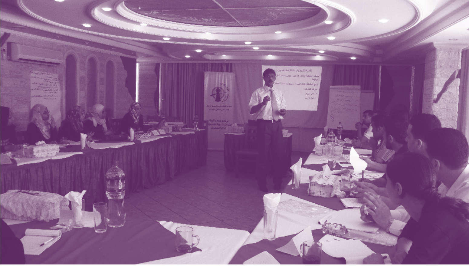
Youth Political Empowerment - Youth training course, Gaza