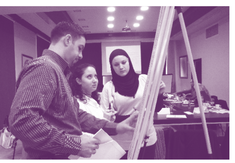
Youth Political Empowerment - Workshop, East Jerusalem

[Funder: National Endowment for Democracy] [Duration of Project: July 2010-June 2011]