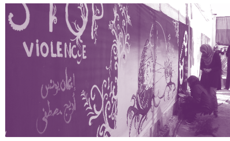
Gender Peace and Security – International Women's Day Graffiti, Gaza