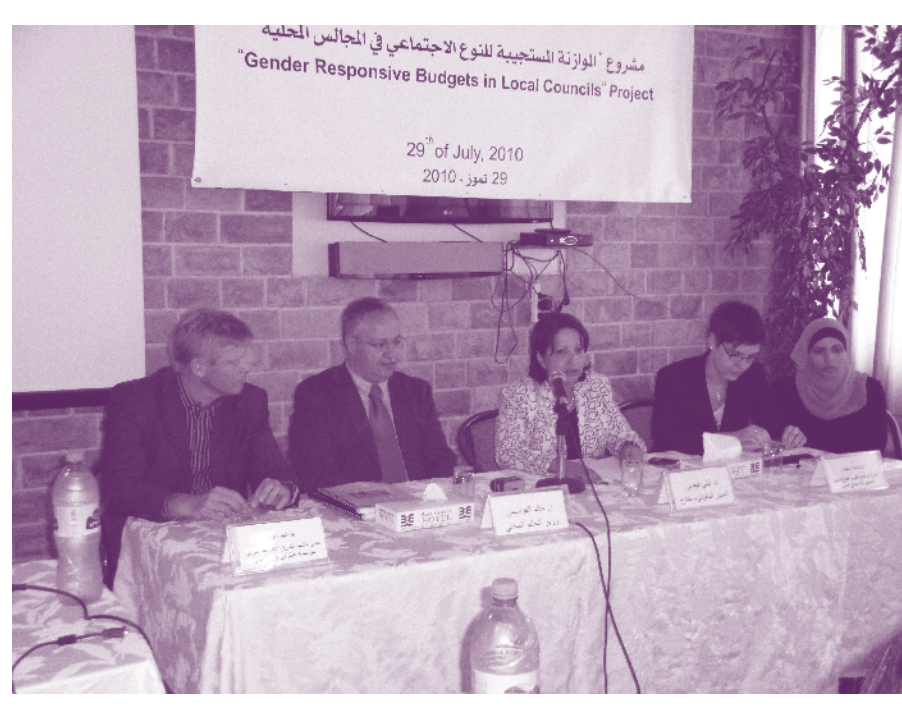
Gender Responsive Budget in Local Councils, Birzeit and Halhoul

MIFTAH completed the implementation of a six-month project which focused on building the capacity of local councils' members and employees, and enhancing their relations with community-based organizations, to promote strategic planning and to develop programs that are more responsive to community needs and gender issues. The activities comprised conducting a participatory needs assessment survey of both Birzeit and Halhoul municipalities to assist these local councils in identifying and prioritizing local community needs, and social auditing including the needs of marginalized social groups who need special attention for mainstream integration; and building their own capacities by developing skills and applying research results to improve the quality of life and planning for future community