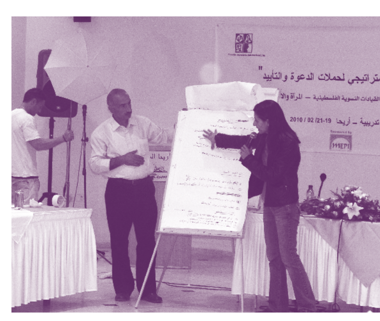
Women in Elections: Women's Electoral Support Points – Centralized training, Jericho