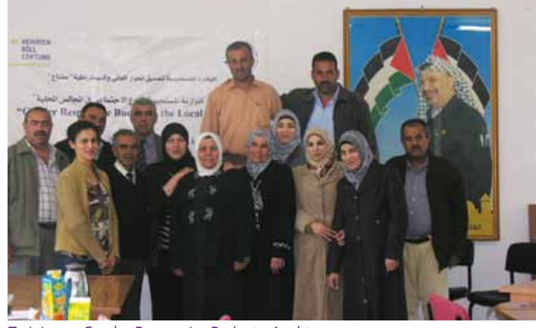
Training on Gender-Responsive Budget – Anabta

Following the pilot project "Gender Responsive Budgets in Local Councils" that was implemented in 2008 at Birzeit municipality, a six-month similar intervention was conducted in the period between February-July 2009. In this new phase, the two municipalities of Halhoul and 'Anabta were targeted. The staff members were introduced to concepts of gender, budgets, and gender-responsive budgets. Target groups included selected members and employees of local councils (Halhoul & Anabta municipalities) and social activists working on women and gender issues within their local communities.