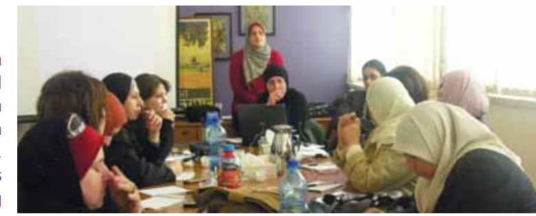
Preparing a training manual on SCR 1325 - MIFTAH

The project "Combating Violence against Women through the Empowerment of Community-Based Organizations" aims at contributing to the elimination of gender-based violence in Palestinian society within the framework of Security Council Resolution 1325, through empowering community-based organizations in Nablus and Hebron districts, and advocating women's issues on the decision-making level.