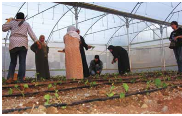
Beneficiaries growing plants in a greenhouse – Deir Ibzei, Ramallah

This year, MIFTAH carried out its "Empowerment of Rural Women through Small Income-Generating Projects" which aims at contributing to the empowerment of Palestinian women in rural areas and empowering marginalized groups through involving them in development. This project contributes to helping women improve their standard of living and opens up economic opportunities to them. It also enables them to be in control of their own funds in order to generate their own income and hence become somewhat self-sufficient within their own families. The project also contributes to developing the community through the capacity building of women.