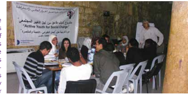
Workshop on "Voluntary Work: Mobilization and Advocacy" - Jerusalem

This project builds on MIFTAH's long experience in the area of youth empowerment. It responds to MIFTAH's serious concern for the situation of the youth sector in east Jerusalem and its suburbs and aims at supporting young people in the city as active Palestinian citizens. The project's target group is youth local groups and nongovernmental organizations in Jerusalem and its suburbs, which in turn will later take responsibility for mobilizing their own local communities for more social activism towards change.