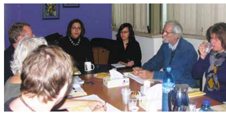
Political briefing- MIFTAH

MIFTAH's Media and Information Department (MID) is one of the two components embedded in the organization's media division. It is within this department where MIFTAH's overall mission is translated into action, specifically the presentation of the Palestinian narrative at the local, regional and global levels.