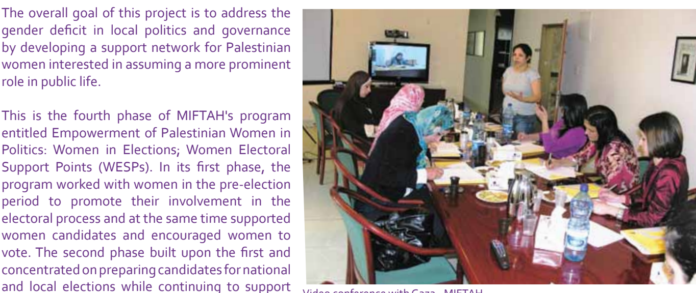
Video conference with Gaza - MIFTAH

entitled Empowerment of Palestinian Women in Politics: Women in Elections; Women Electoral Support Points (WESPs). In its first phase, the program worked with women in the pre-election period to promote their involvement in the electoral process and at the same time supported women candidates and encouraged women to vote. The second phase built upon the first and