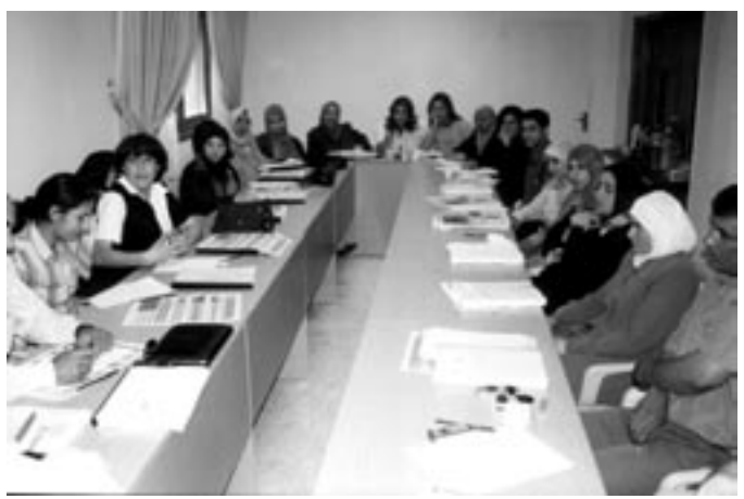
Empowerment of Young Leaders. Dialogue Session June 2, 2004 - Jenin.

{Funded by National Endowment for Democracy} {Effective dates of project: November 1, 2003- September 30, 2004}