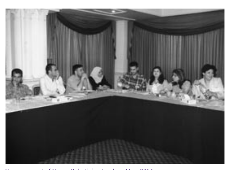
Empowerment of Young Palestinian Leaders. May, 2004

As part of its plan to raise the awareness of young community leaders on issues of democracy, good governance, women's rights and citizenship, MIFTAH prepared an Information Kit made up of a collection of articles and statistics from different sources including the internet,