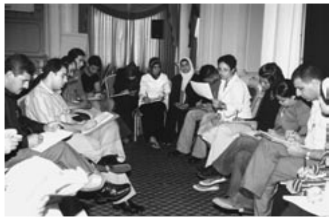
Empowerment of Community Leaders. Oct. 7, 2004

MIFTAH's project The Empowerment of Young Community Leaders the West Bank and Gaza aims at empowering young community Palestinian leaders. The objectives of the project include identifying the needs of young community leaders, building their capacity,