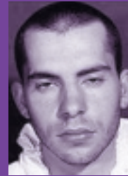
Copeland: Nazi nailbomber