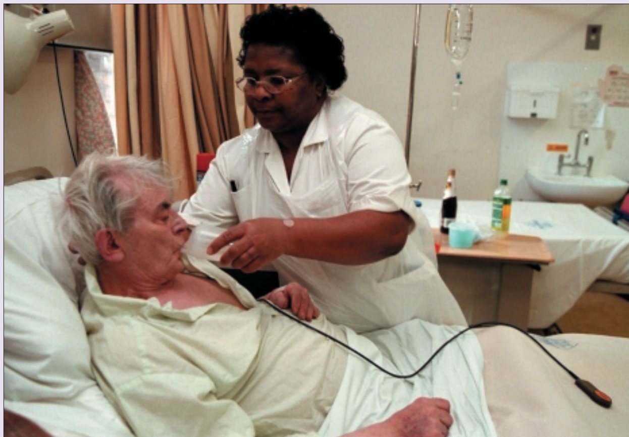
The BNP hates the workforce that sustains the NHS