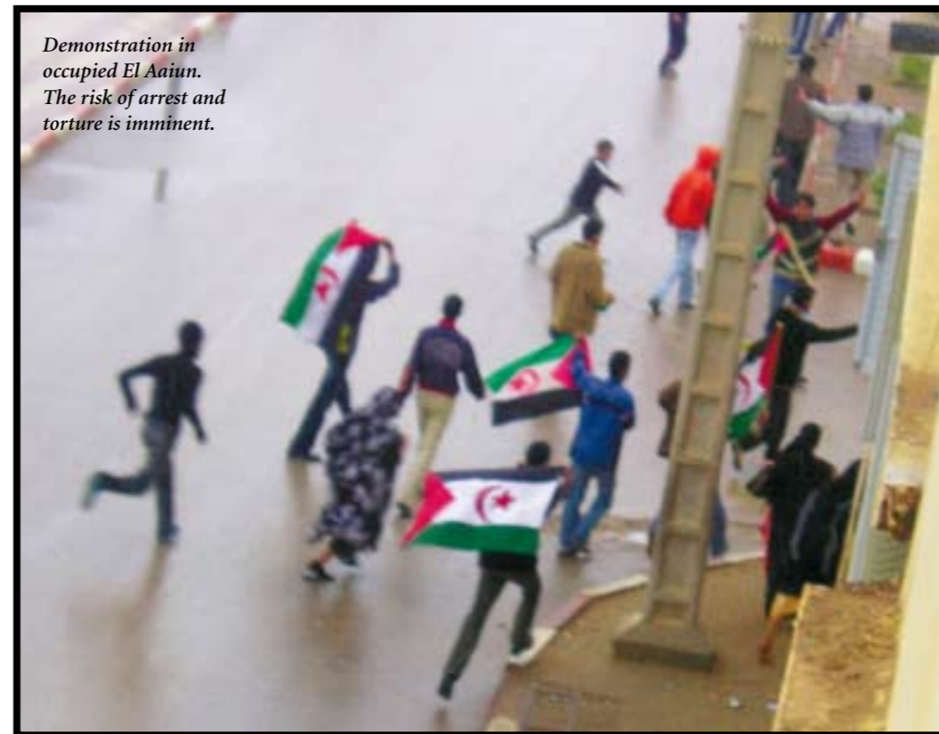
Demonstration in occupied El Aaiun. The risk of arrest and torture is imminent.