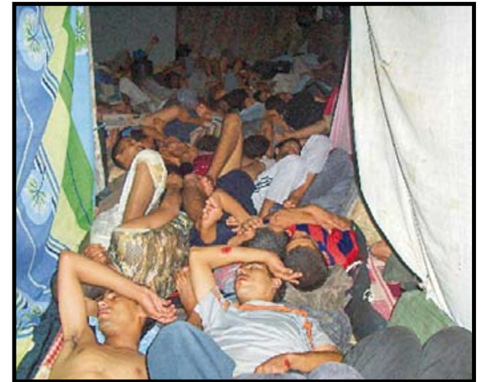
From the inside of the infamous "black prison" in the Western Saharan capital, where the majority of Sahrawi political prisoners are kept.