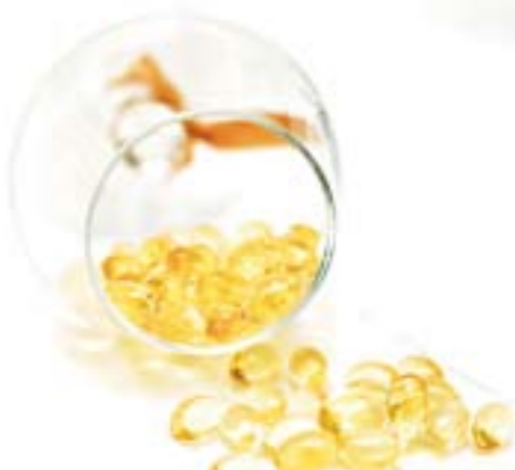
Fish oil from Western Sahara end up in Omega 3 capsules all over the world, particularly Norway.

Kerr-McGee subsequently lost several of its other shareholders, until in 2006 it made public that it would no longer continue its activities in Western Sahara. ■