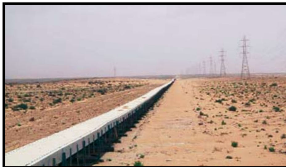
The Moroccan conveyor belt for phosphates from the occupied Western Sahara is more than 100 km long and thereby the world's longest.

ALL COUNTRIES HAVE A RESPONSIBILITY The international community and individual countries have a responsibility to resolve the conflict in Western Sahara and to protect the rights of the refugees. As the High Commissioner for Human Rights states, the international community must take all necessary steps to ensure that the right to self-determination is respected. Common Article 1 of ICCPR and ICESCR oblige all member states to promote the realisation of the right to self-determination and respect that right, in accordance with the provisions of the UN Charter. 52 Since the obligations we have dealt with, are peremptory norms and apply erga omnes (that is, in relation to all; not just between parties), all states must do what is in their power to make the parties respect them. According to the Articles on State Responsibility, individual states have a duty of