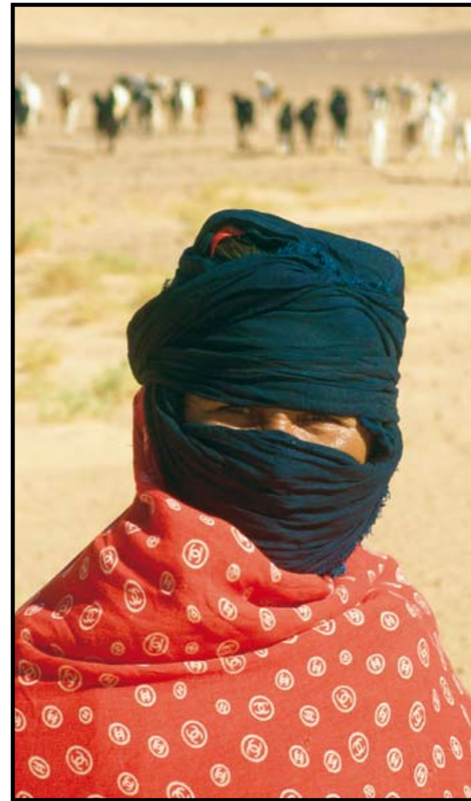
Camel and goat herding forms the basis of the livelihood of the Sahrawi nomads.