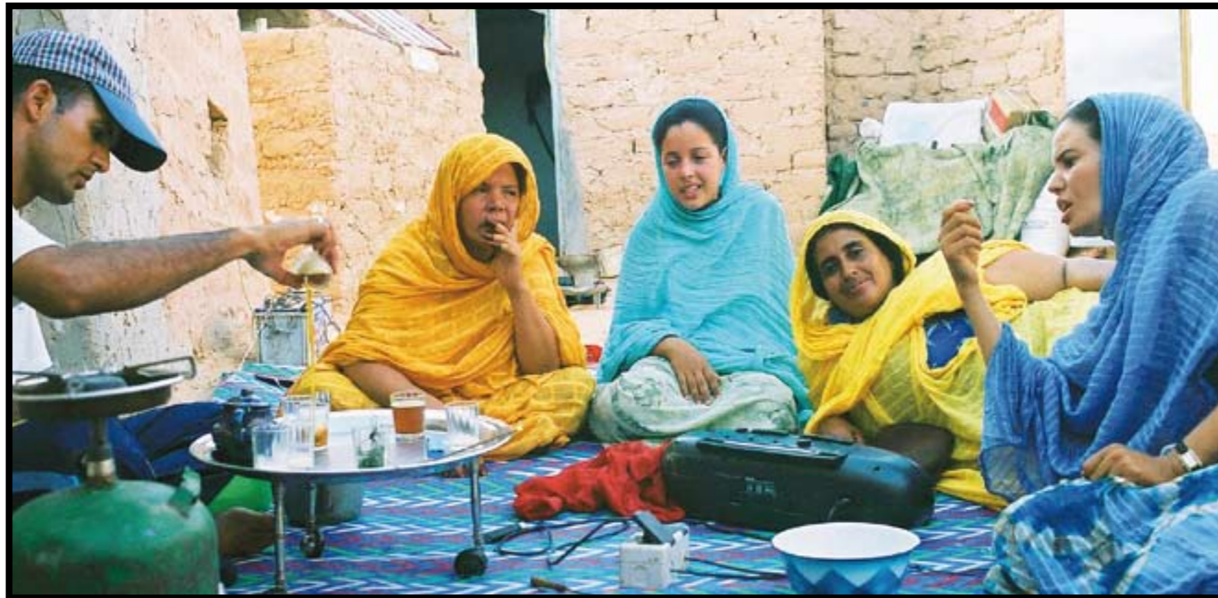
The tea ritual is important in the Sahrawis' culture and their daily lives.

INSISTENCE ON INTEGRATION The Sahrawis have been promised a referendum which will decide their own future. Over 100 UN resolutions and