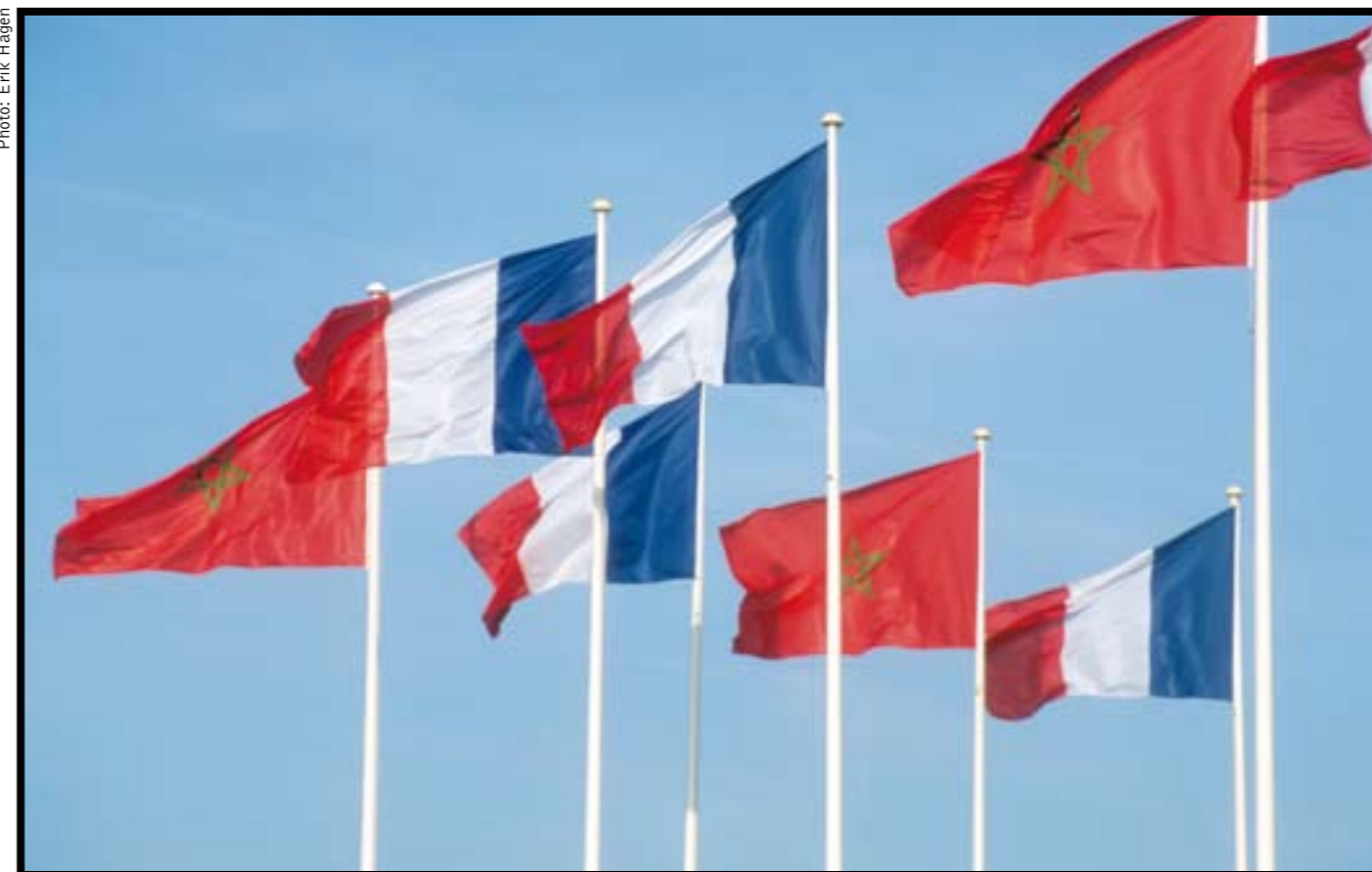
Strong bonds between Morocco and France have protected the occupier against necessary pressure.

pressure on the occupier. Countries friendly to the Sahrawi cause, such as Sweden, Finland and Ireland, have until now failed to outweigh the pro-Moroccan lobby.