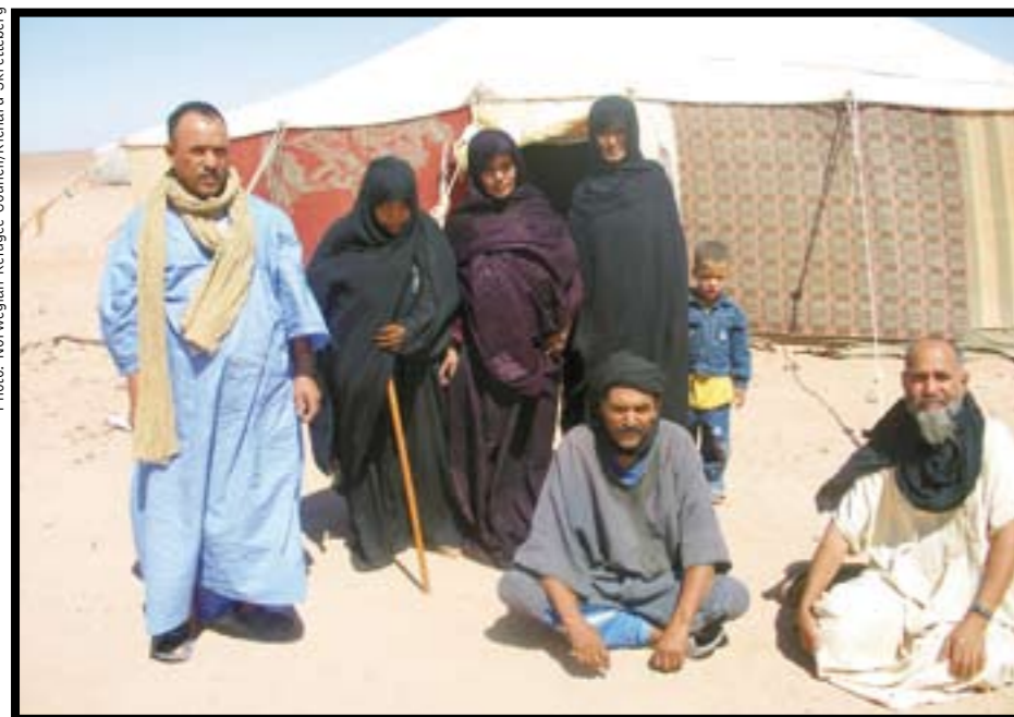
A small number of Sahrawi nomads still live in the Polisario controlled areas of Western Sahara.

REFUGEES The humanitarian situation of the refugees in particular is becoming more and more precarious. The ICESCR has special arrangements allowing developing countries to prioritise their own citizens to a certain degree, but the 1951 Refugee Convention contains some minimum social and economic standards for refugees. Algeria, as an asylum country, must meet its obligations according to the basic human rights conventions and the 1951 Refugee Convention, to which it is a party. Member states of human rights conventions are under an obligation to respect and promote the rights of all people within their territory, including refugees and asylum seekers. Algeria, however, is of the view that they have no responsibility for the refugees, due to the fact that they are organised by a government in exile, SADR, led by Polisario. Algeria's stance has no support