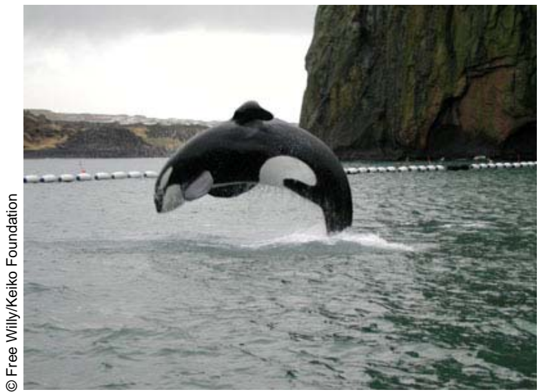
Keiko became even more active in Iceland.

Orcas born and raised by their family in the wild, even if only for a few years, never