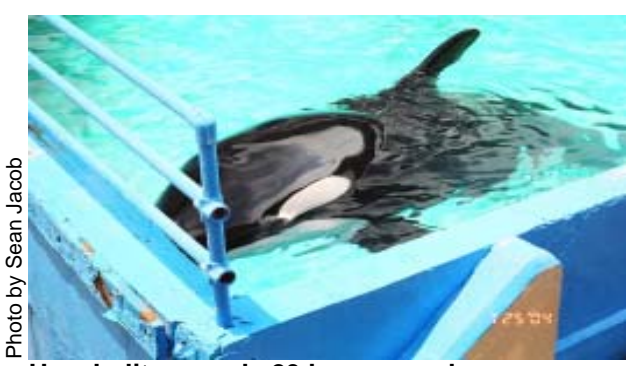
How Lolita spends 23 hours per day.

with her family. At the age of about 40 Lolita is still within her potential reproductive years and could contribute a calf to this fragile population.