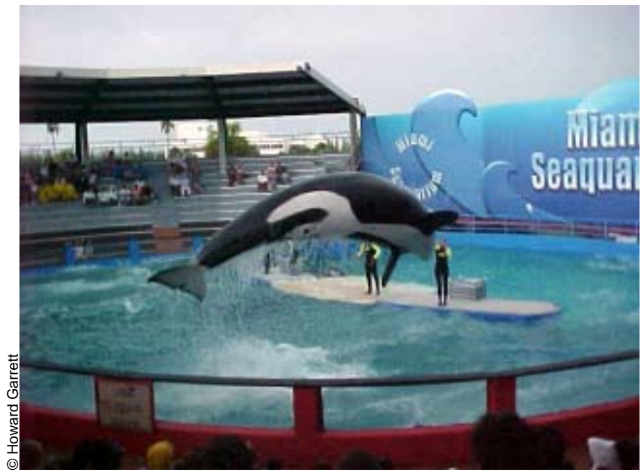
Lolita shows extraordinary strength and stamina and has survived 20 years longer than all the others captured from her family.

The lesson from Springer is that upon Lolita's return there may be some confusion and even some disturbance at first, and a period of rebuilding trust can be expected, and probably a transition period of weeks or months as she makes a place for herself in her pod. And of course there is the possibility