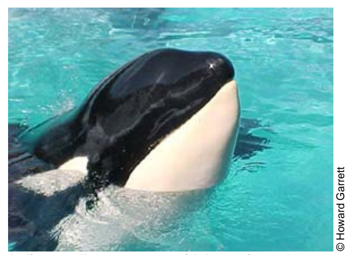
Lolita usually cooperates with her trainers, but sometimes refuses to perform her routines.

• Isn't her habitat so polluted she might die there?