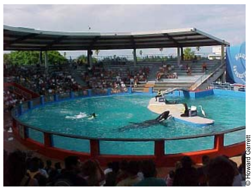
The tank where Lolita has lived since 1970 is only 20 feet deep with sloping sides. Lolita is 22' long.

that she will not successfully rejoin her family. As the proposal describes, a feeding and care station will be available for her in Haro Strait, where L pod has appeared on almost a daily basis for about half of each year since studies began over 30 years ago. Since there is no record or indication of any kind of physical aggression among the Southern Residents, and orcas have no predators, we don't have to fear any risk to Lolita physically.