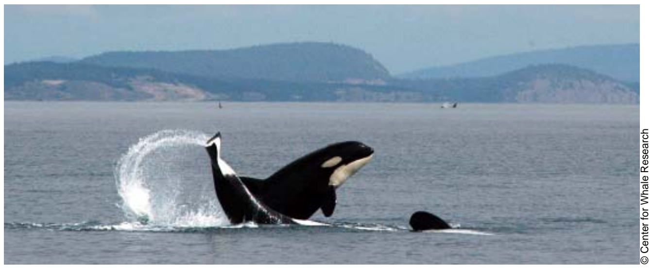
Some of Lolita's extended family at play in Washington's inland waters.

• After 37 years under human care, Lolita is totally conditioned to trust and respond to man, a trait that could be dangerous to her in the wild. With animals intended for release back into the wild, such as rehabilitated injured manatees, human contact is kept to a minimum and held to a far shorter period of time.