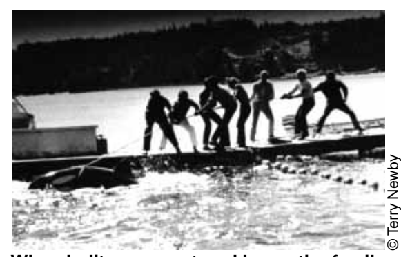
When Lolita was captured her entire family stayed nearby until she was removed.

Lolita is a very special orca. Her survival is beyond all expectations. Of the 45 of Lolita's extended family, the Southern Resident orcas, captured and delivered to parks around the world between 1965 and 1975, all the others were dead by 1987. She is known to be courageous, yet so very gentle. She has endured 37 years of confinement while performing two shows per day, without the company of any other orca since 1980. She deserves a chance to retire to her home waters and visit with her family once again.