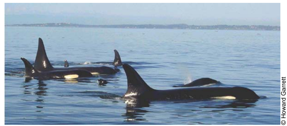
Some of the 87 members of Lolita's extended family in Washington. Unlike any other mammal known, both male and female offspring stay with their mothers for life. Together they are active day and night, foraging, socializing and travelling 75-100 miles per day.

We are thrilled that you support the campaign for Lolita. Since our efforts began in 1995 we have known that Lolita would need high-profile spokespersons to help present the case for returning Lolita to her home and family. By adding your voice and energies to the many thousands worldwide who are pleading for Lolita to have a chance to return home you greatly enhance her prospects for happiness.