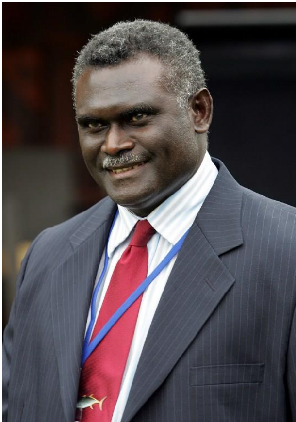
Solomon Islands Prime Minister Manasseh Sogavare.

The Solomon Islands' penal code features defamation and libel laws which have been enacted with the oft-quoted 'chilling' effect on free speech and vigorous reportage—but the country also enjoys constitutional guarantee of press freedom, straight from the global human