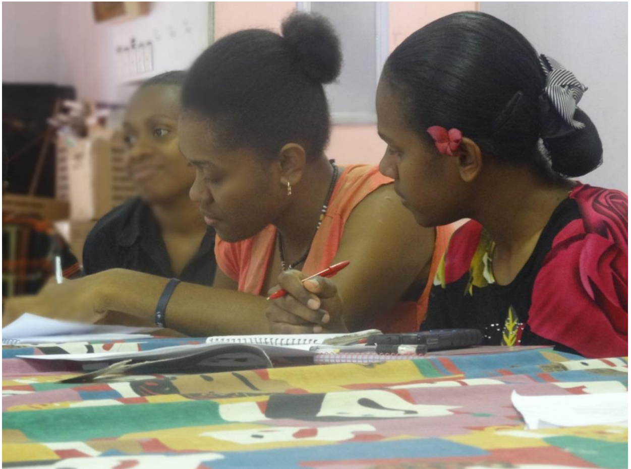
IFJ union workshop in Vanuatu 2014.