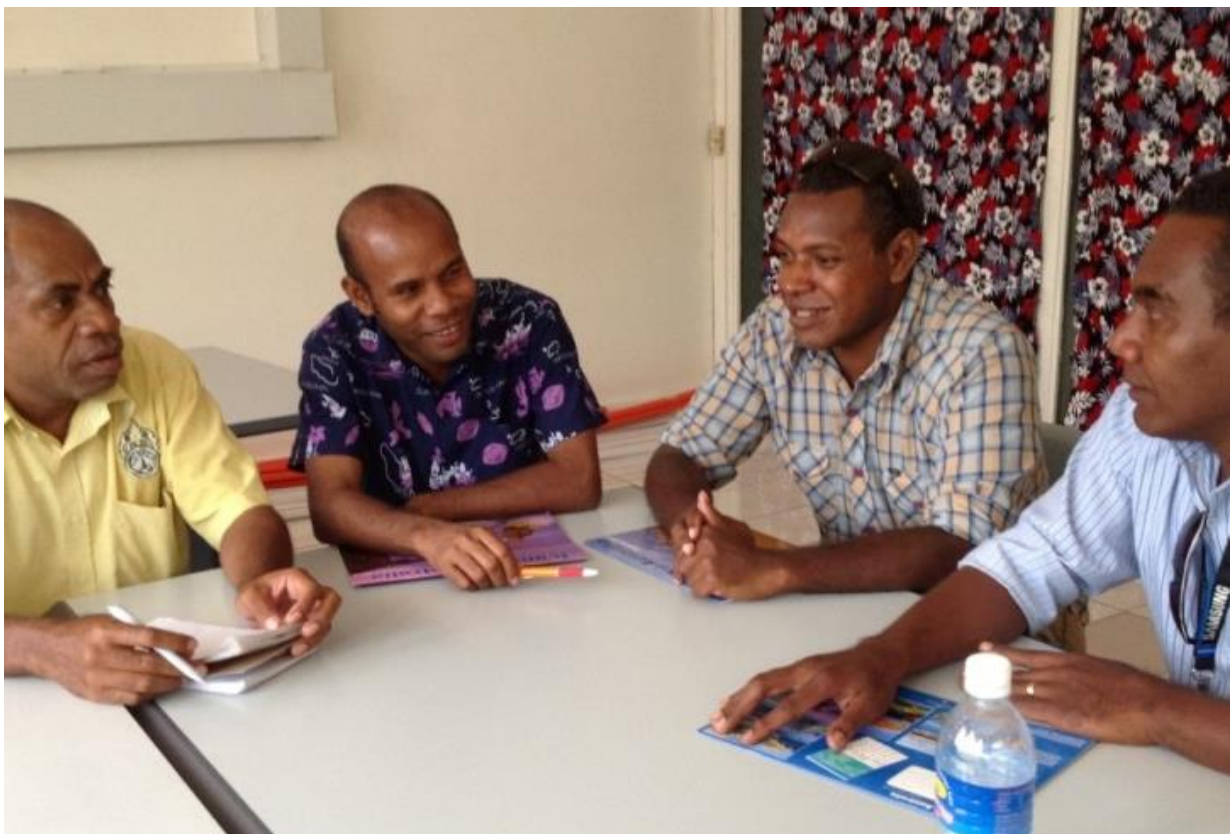
The MASI Executives discuss ways to strengthen the Association in 2012.

Along with that has been the growth of citizen-led debate and conversation via social media, a continued surge in mobile telephones aiding media and information access, and two record awards in defamation suits between politicians and newspapers. Add to this the traditional 'kastom' law around payment of compensation for grievances. In the absence of a clear and contestable public complaints/feedback process, there is little doubt that the outlook for MASI in serving the needs of its members in the Solomon Islands is busy! What is also certain is that support and donor partnerships such as the targeted national media assistance scheme which were part of the RAMSI 'helpem fren' assistance to the country, will continue to be necessary until a viable long-term media model is in place.