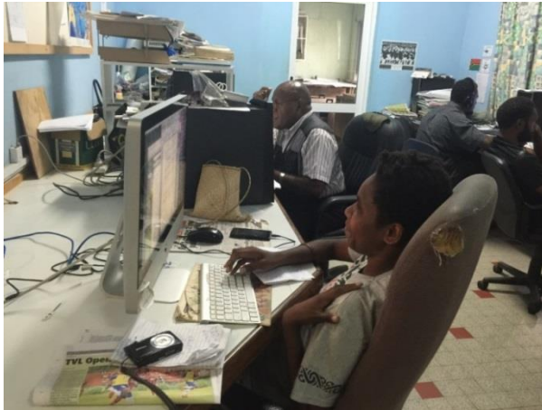
Newsroom journalists, Vanuatu Daily Post.

technologies have no doubt ushered in an awakening of the consciousness of the Vanuatu public about their rights to be informed, and to be part of national conversations.