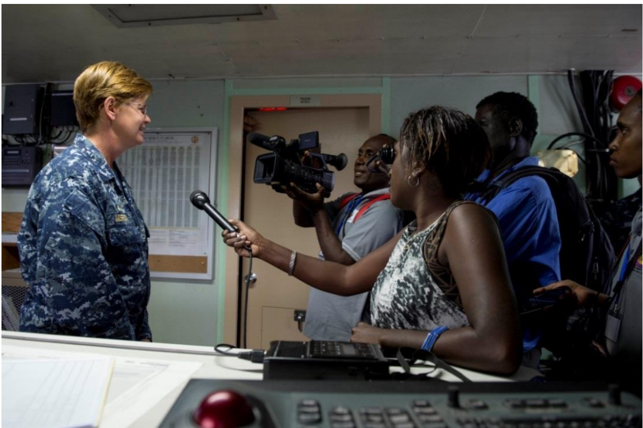
Local media interview a member of the US Air Force.

The general breakdown in ethical journalism in PNG plays out in a number of ways and it is widely known that journalists accept money and other objects including paid trips and allowances to write and report stories, especially about politicians.