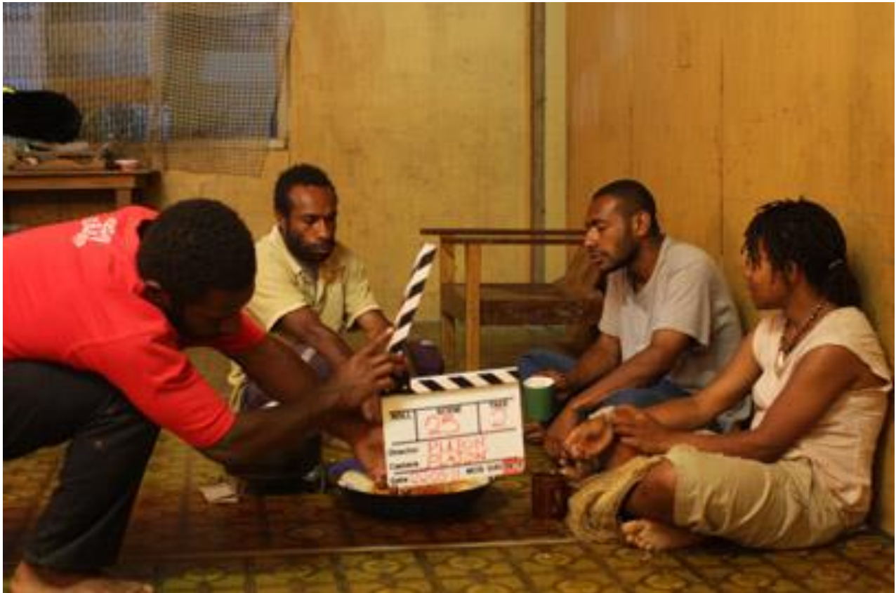
Komuniti Tok Piksa (KTP) in a filming session, an initiative of the Centre for Social and Creative Media of the University of Goroka.