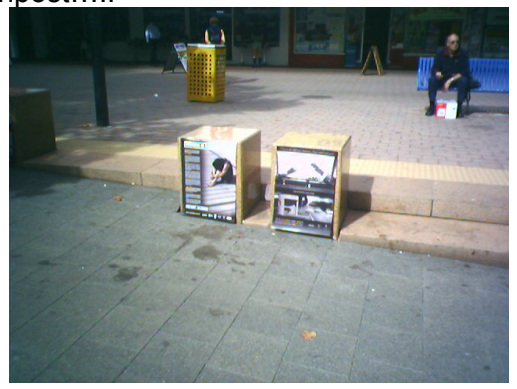
Decorated pillars..."Housing as a human right posters".