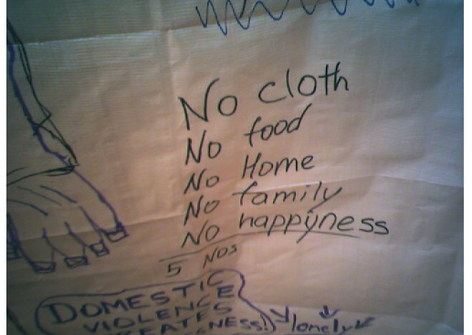
The 5 Nos.....