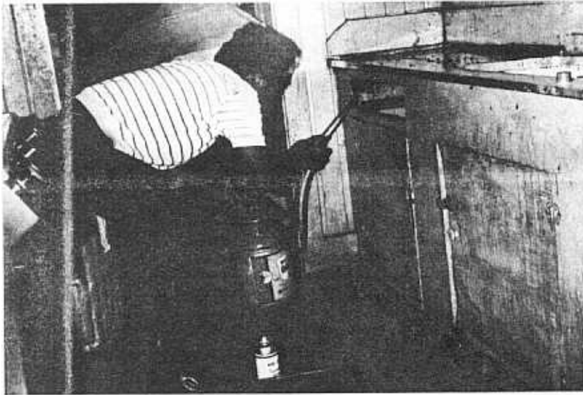
Comrade from Houston Branch rids house of disease-carrying pests.

ALL POWER TO THE PEOPLE Houston, Texas Branch Black Panther Party