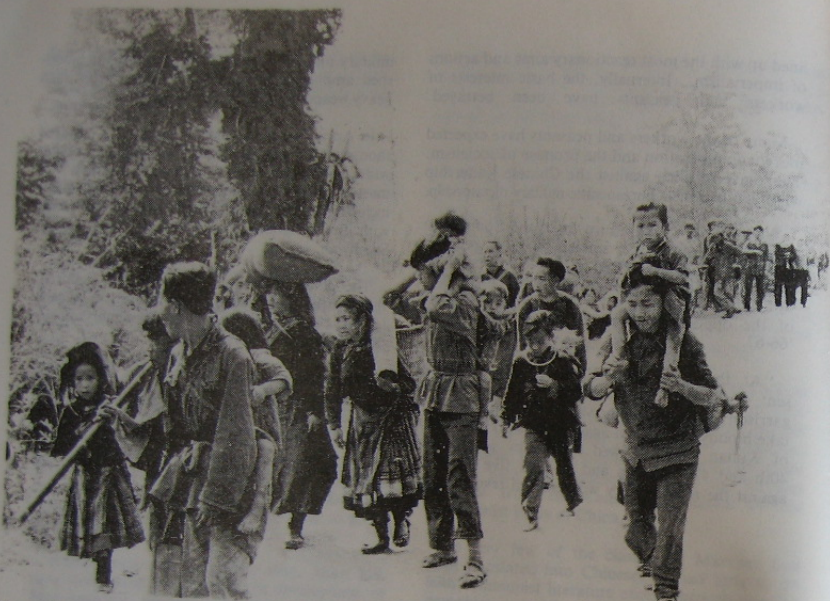
Tens of thousands of people living in the border provinces of Vietnam were forced to flee south to escape Chinese artillery and advancing tanks and troops. This photo shows Meo people from Muong Khuong district in Hong Lien Son province fleeing from the invading forces.