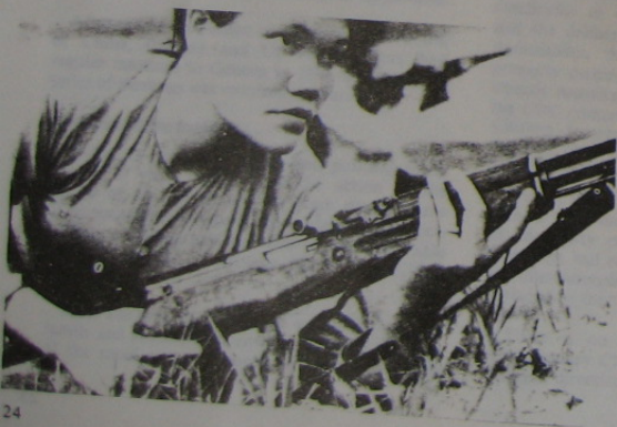
The victims... and a defender