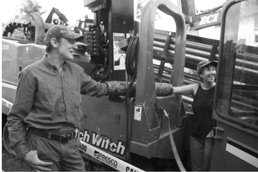
Two Vermonters lock to a ditch witch, stopping work at a VGS pipeline construction site.

Community members have been protesting the site of