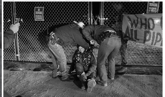
Water protectors in Texas halt construction at multiple sites along the Trans-Pecos Pipeline route. (Page 7)