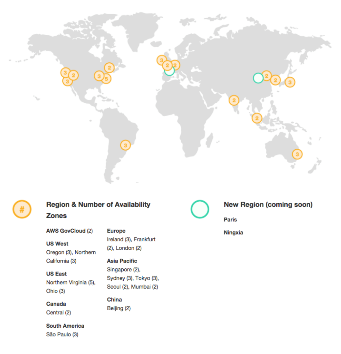
Figure 1 – AWS Regions and Availability Zones

AWS customers choose the AWS Region(s) where their content will be hosted. This allows customers with specific geographic requirements to establish environments in a location(s) of their choice. For example, AWS customers in Europe can choose to deploy their AWS services exclusively in the EU (Frankfurt) Region. If the customer makes this choice, the customer will be able to point to a specific location where their content will be stored in Germany. Unless customer chooses another region, customer content will not be mirrored on servers of another AWS Region.