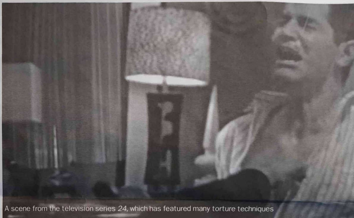
A scene from the television series 24, which has featured many torture techniques