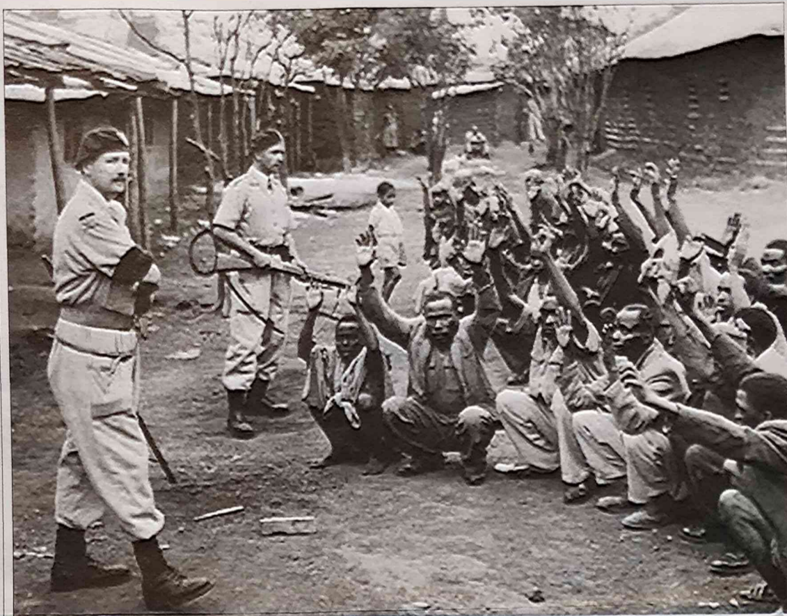
Captured Mau Mau rebels

throughout the world that such ‘governance’ entails.