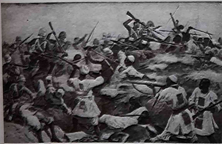
The battle of Omdurman

The book ends with some interesting reflections on British foreign policy and its relation to the American Empire – supported, of course, with enthusiasm by Niall Ferguson. Newsinger indicates that since the Second World War the British Labour Party has always allied itself with the American Empire – as it had earlier supported the British Empire. Thus, Blair's willingness to subordinate himself to one of the most right-wing, reactionary and openly imperialist administrations in US history, simply expresses a continuity with the policies of past Labour governments. What is new though is Blair's enthusiastic support for the neo-conservative agenda, namely, his open embrace of the interests of big business and the rich. Small wonder that Rupert Murdoch is now described as the patron saint of New Labour.