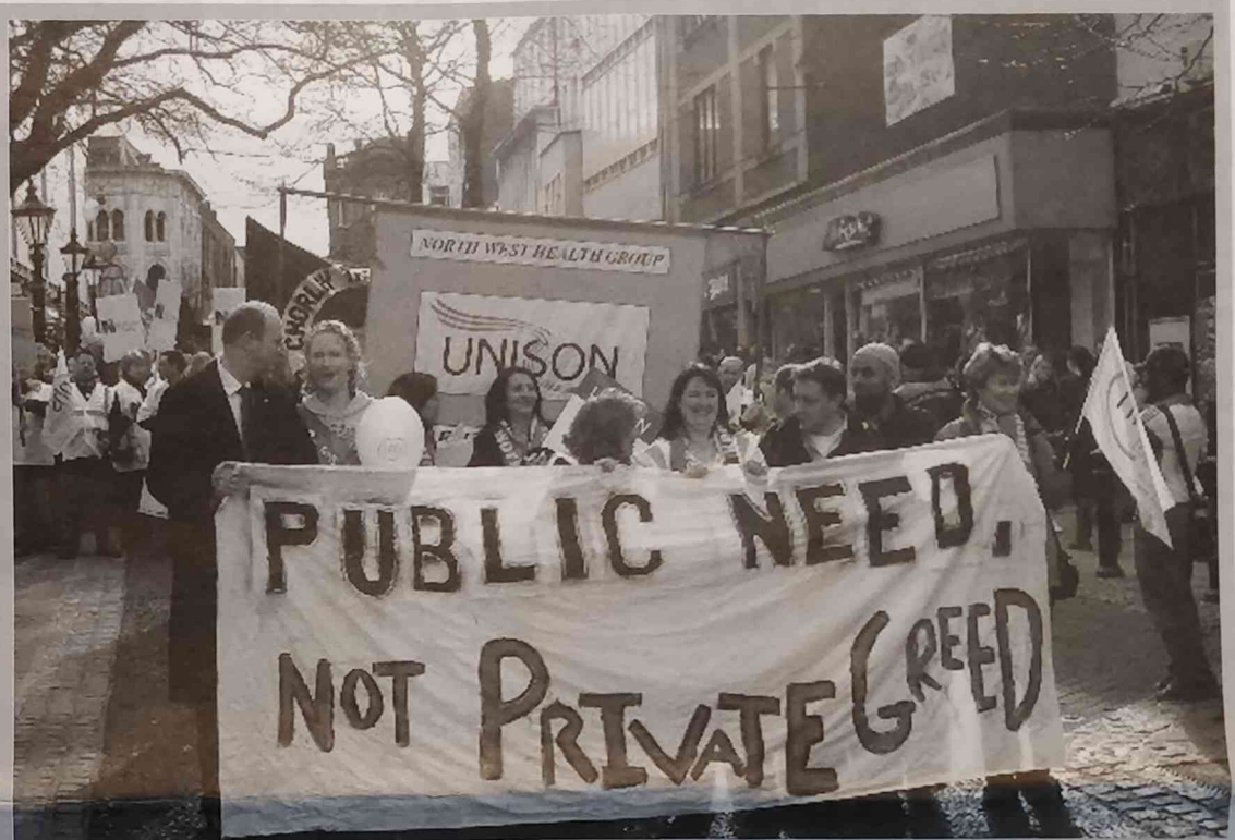
NHS DAY: Despite the shutting down of attempts to build a national demonstration in London against NHS privatisation by Unison officials, people across the country used 3rd March to demonstrate their support for a nationalised NHS and demanded the cessation of privatisation in the sector. This protest in Preston attracted over 250 people, according to the photographer.