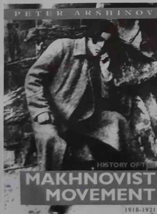
Available post free from Freedom Press, 84b Whitechapel High Street, London E1 7QX.

This book is also an indictment of the Bolsheviks' ruthless treatment of ordinary people when they dare to organise themselves instead of allowing themselves to be led. For Arshinov, the Bolsheviks did not 'degenerate' or take a wrong turn – they were self-serving gangsters and parasites from day one. To fight them required a highly organised, highly motivated force like the Makhnovists. Although some might disagree with all of Arshinov's conclusions, one thing this period of history teaches us is that 'anarchy' does not and cannot equal disorganisation.