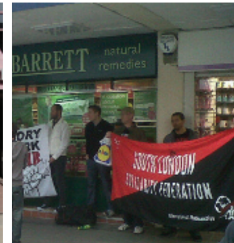
Protests against workfare, from left to right, in Brighton, Wimbledon's CWU headquarters and Catford in south east London.