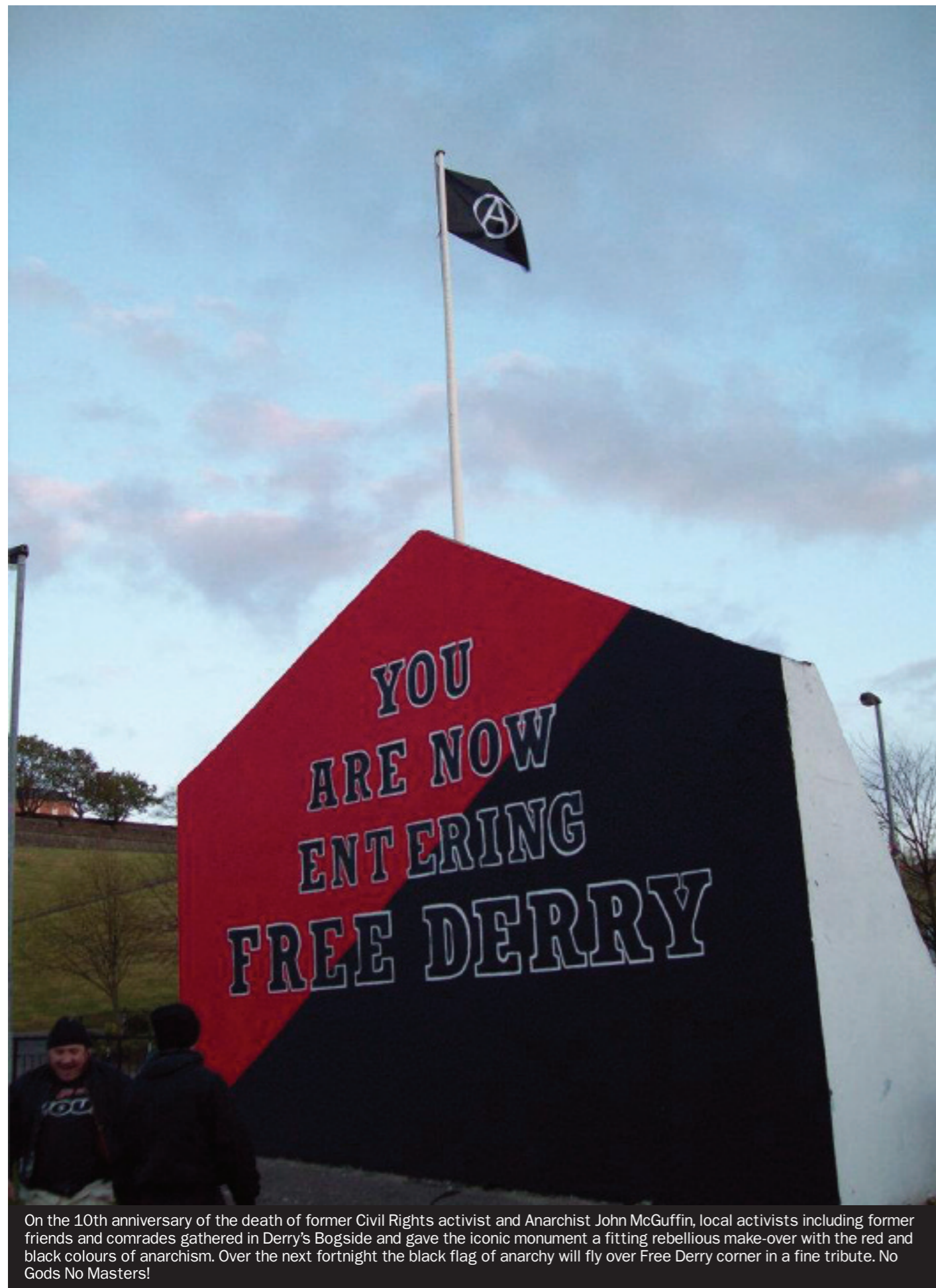
On the 10th anniversary of the death of former Civil Rights activist and Anarchist John McGuffin, local activists including former friends and comrades gathered in Derry's Bogside and gave the iconic monument a fitting rebellious make-over with the red and black colours of anarchism. Over the next fortnight the black flag of anarchy will fly over Free Derry corner in a fine tribute. No Gods No Masters!

http://www.derryanarchists.blogspot.co.uk/