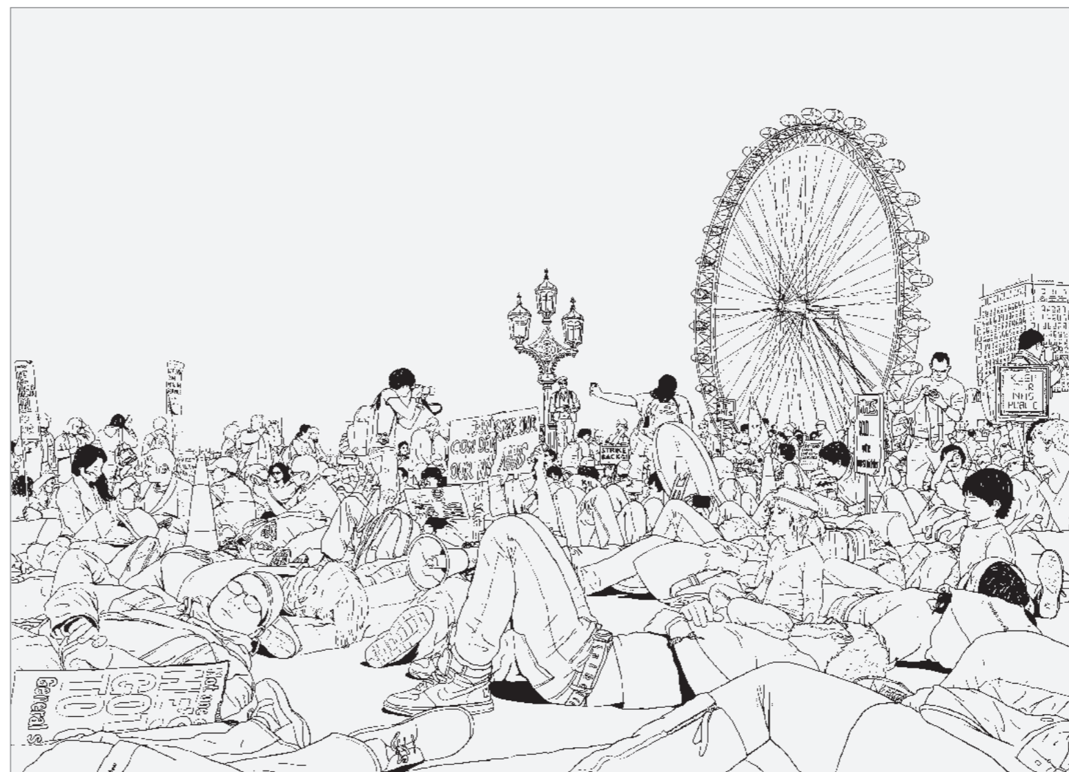
Illustration drawn by Giulia Barbera after the 9th October 2011 demonstration to save the NHS. 9

In addition, £8m a year is going straight to the Bridgepoint fund investors that bought Care UK as dividends on £126m of "cumulative preference shares" which do not allow voting rights but guarantee a