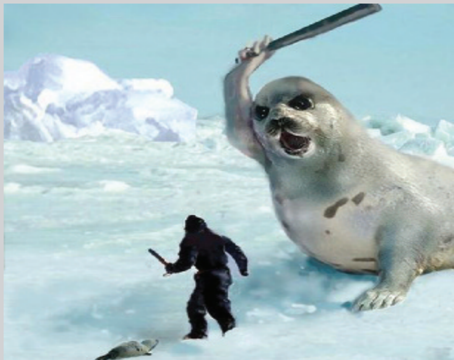
While debate continues in the anarchist movement over relations with our non-human comrades, some have been taking direct action for themselves as recorded in this snap taken by Freedom's ace wildlife photographer Guido Littlechap.