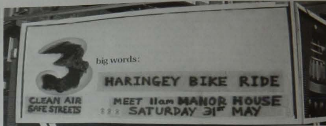
From billboard to community noticeboard: subvertising in Haringey

Then came the poll tax – a huge turning point. Through our contacts with Claimants Unions in Scotland (where the tax was first brought in) we in TCU thought it could be beaten. In 1988 Tottenham Against the Poll Tax (TAPT) was set up, based in the Unwaged Centre – one of the first anti-poll tax groups in England – and soon after, libertarian activists elsewhere in the borough were the key to the setting up of Hornsey & Wood Green APT, followed by Green Lanes APT. These three groups were the basis of a Haringey-wide mass non-