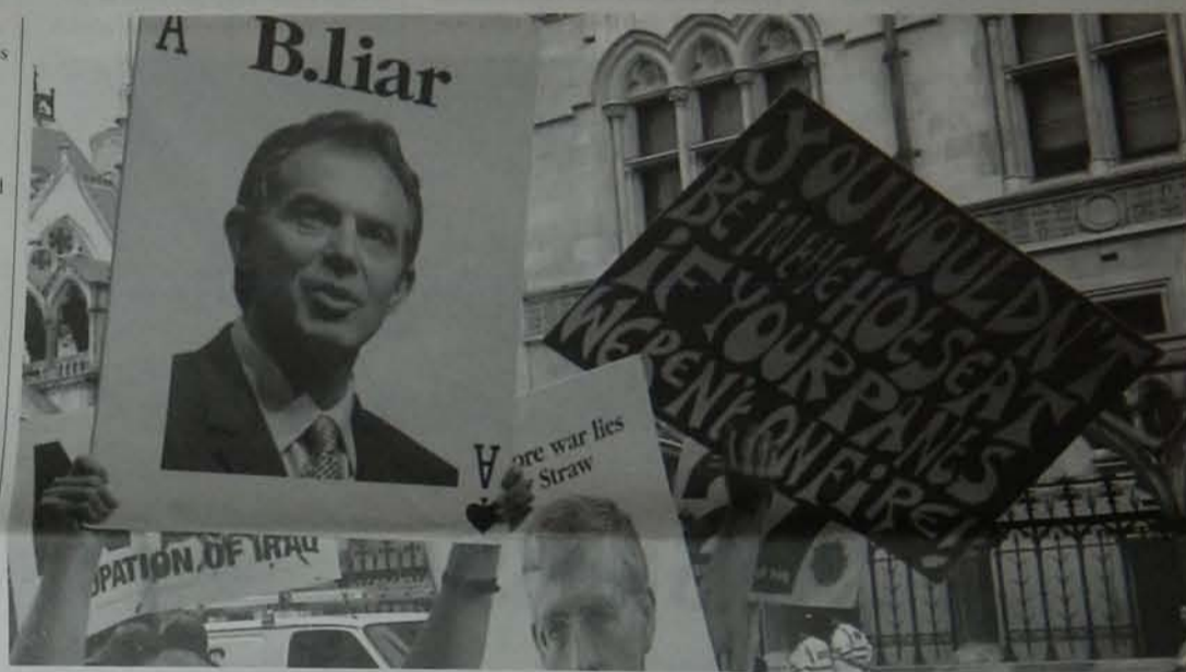
Anti-war demonstrators outside the Hutton enquiry

Perhaps he was picked precisely on his ability to ignore what he, and all of us, heard at his inquiry? Subconsciously, of course.