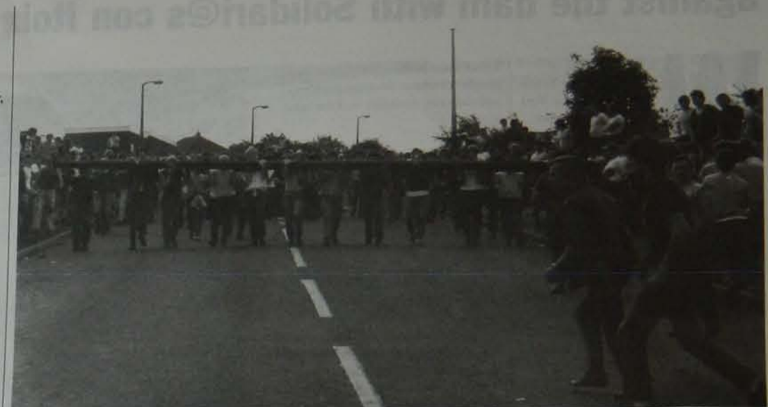
Militant pickets during the miners' strike in Yorkshire

Anarchists have little time for the way the current trades unions are organised and act. They are bureaucratic and top-down. The rank and file have little say: their power is delegated to leaders, whose interests are more often in maintaining their huge salaries than fighting in the interests of their members. The unions are hopelessly sectionalist. While we have one boss, we are divided into many