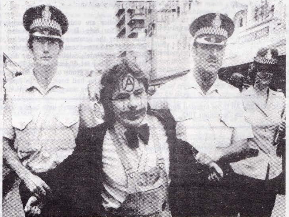
Anarchist demonstrator arrested in Brisbane

Prior planning and training sessions were held by the group who planned to be arrested (called the Committee of 50), posters were put up, forums held, leaflets distributed, a guerilla march held, and an open letter to the police was distributed to all police stations throughout the city. This letter asked police to consider not enforcing undemocratic and repressive