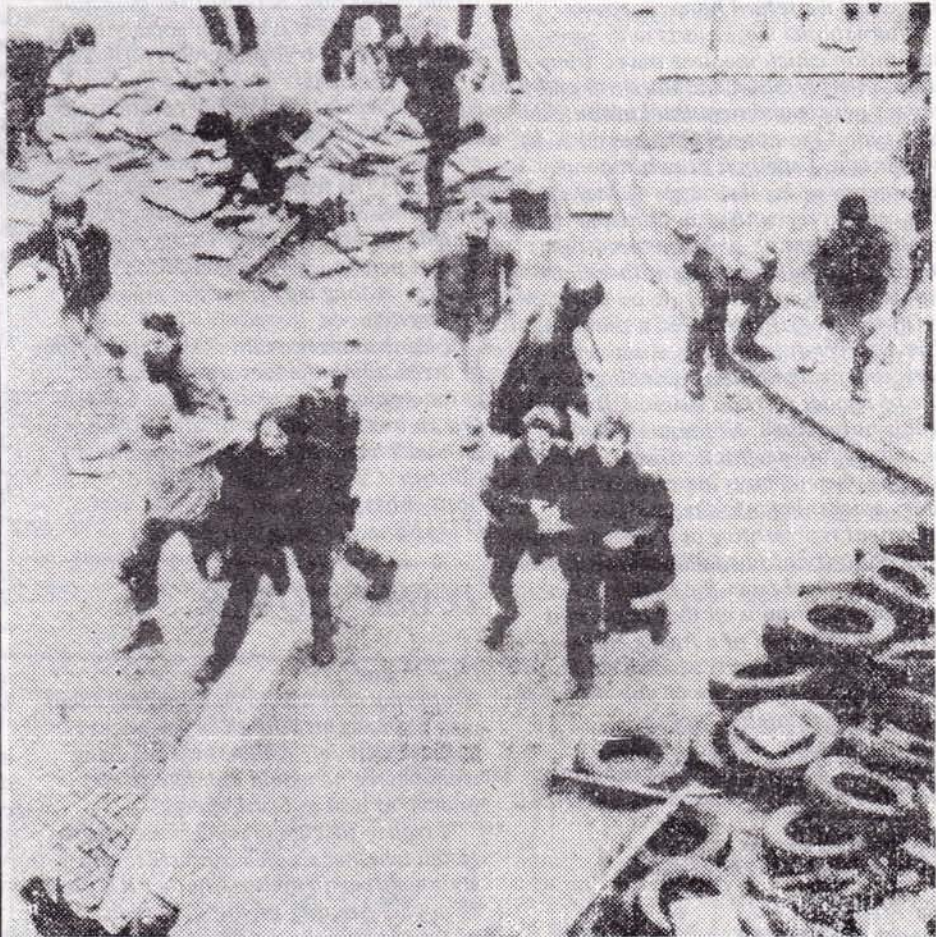
Amsterdam street party